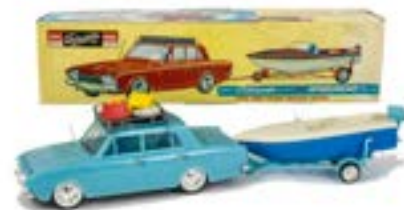
455. A Telsalda (Hong Kong) Plastic Consul Corsair With Speedboat On Trailer , Model 20767, light blue friction drive plastic Corsair, white/blue Speedboat on light blue trailer, three pieces of luggage, roof rack, spare wheel, in original box, E, box VG £60-80