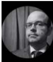
Dominic Foster Toys