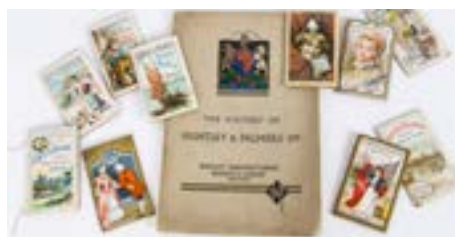
449. Huntley and Palmers History book dated 1926 , together with ten Huntley and Palmer Almanacs, 1891, 1893, 1894, 1895, 1896, 1897, 1898, 1899, 1900 and 1913, VG (11) £100-200