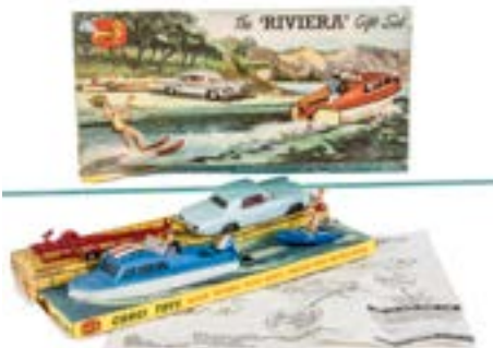
166. A Corgi Toys Gift Set 31 The Riviera, comprising Buick Riviera, Dolphin 20 Cabin Cruiser, Brooklands Trailer, Water Skier, Captain figure, in original box with inner tray and instructions, VG, underside on water skier heavily damaged, lacks rope, box P, tray G £50-70