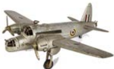
447. A wooden RAF Blenheim style Bomber Airplane , with metal cockpit and gun positions with opening bomb doors, with one bomb, painted silver with RAF roundels, possibly made during or just after WW2 £80-120