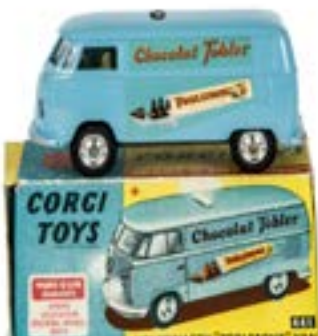
165. A Corgi Toys 441 Volkswagen "Toblerone" Van, light blue body, trans-o-lite headlamps, spun hubs, in original box, E, box F-G £50-70