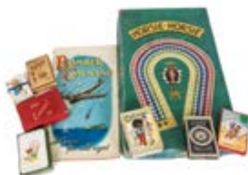
452. Wartime Board Game 'Bomber Command' , with original instructions envelope containing card counters, boxed Pepys Series Horsie-Horsie, Thomas De La Rue & Co Golliwogg A Round Game, Belisha Card Game, Riders Of The Range, Waddy Production Colomino, John Jacques Happy Families, Geo Wright & Co Change For A Shilling, F-G, boxes P-F (qty) £80-120