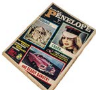
451. The First Issue of TV21 Comic Thunderbirds 'Lady Penelope' , including stories 'Perils of Parker', 'Man from UNCLE', 'Beverley Hillbillies', 'Space Family Robinson', 'Bewitched' and 'Marina' from Stingray, F, wear around edges, some ageing £50-80