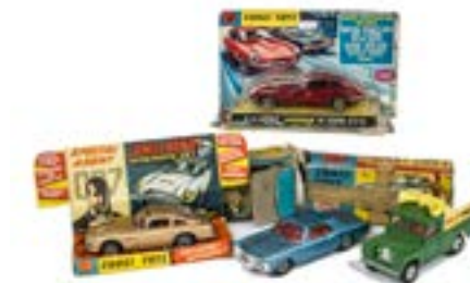
168. A Corgi Toys 261 James Bond's Aston Martin, gold body, red interior, wire wheels, Bandit figure, 335 Jaguar E Type, 245 Buick Riviera, in original boxes, loose 472 Public Address Land Rover, G-VG, 261 lacks any secret instructions, boxes P, stand F (4) £60-80