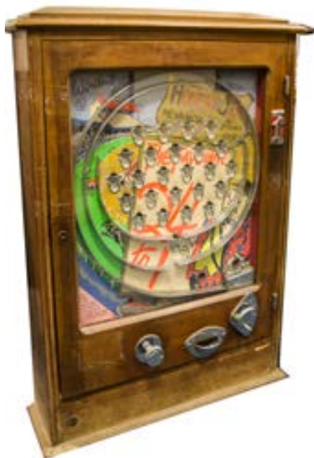
446. A Wanders Allwin 'Honest Joe Nevanok' penny flick slot machine , with spiral leading to 24 winning holes, glass front with oak surround, VG £800-1200