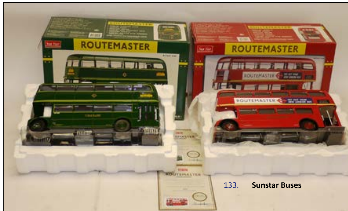
133. Sunstar Buses