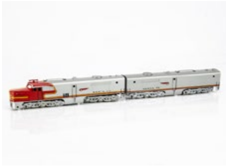
452. Balboa Precision Engineering Japan Brass American HO Gauge Alco Diesel Locomotive , a two car unit both boxed 602 A Unit No 51 and 622 B Unit both in silver/red/yellow Santa Fe livery, with serial number and initials to underside of B unit possibly the painter, retailed by Millholme Models Nottingham, E, Boxes F, (2) £200-300