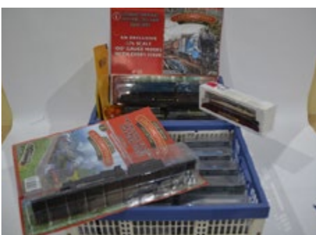
461. Atlas Editions and Del Prado Locomotive Models , a collection of 100 N Gauge plastic models Locomotives of the World (98 bubble packed), by Del Prado, together with OO Gauge examples by Atlas Edition and similar (6) mainly packaged, G-E, (Qty) in three boxes £50-80