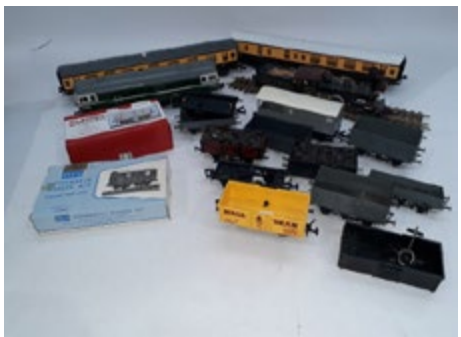
469. Lima and other Finescale 0 Gauge 2-rail Trains , Lima items including BR green class 33 diesel locomotive D6506, two GWR bogie coaches, several open wagons (some weathered) and a 'Toad' brake van, with a Rivarossi American 4-4-0 'Genoa' and tender in Virginia and Truckee RR livery, an unmade Peco GWR van kit and Slater's 'Norchard' PO open wagon, two hand-made finescale track turnouts and other items, mostly G-VG (qty) £50-80