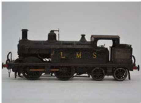
464. A possibly Leeds or Scratch-built 0 Gauge 3-rail ex-MR Johnson 0-4-4 Tank Locomotive , appearing to incorporate a Bassett-Lowke motor and Leeds wheels, in LMS unlined black as no 1303, P-F, paintwork deteriorated throughout, some wheels 'fatigued', one buffer and rear bogie loose, pick-up shoe missing £80-120