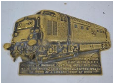
458. Cast Heavy Brass Plaque Commemorating The Deltic Locomotives , a limited edition plaque 599/3000 cast from brass salvaged from scrapped Deltic Locomotives at B.R.E.L. Swindon, stamped G171 on reverse, (with casting crack) 19cm high £40-60