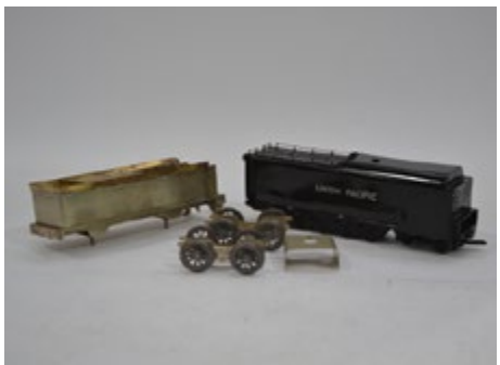
468. 0 Gauge American and Gauge 1 LSWR kit-built tenders , the American tender, well-made from a brass or similar kit, a 7-axle type suitable for 'Big Boy' or 'Challenger' locomotives, finished in gloss U.P. black, G-VG, together with an incomplete nickel-silver kit-built LSWR-style 'water-cart' tender, unpainted, lacking various components (2) £40-60