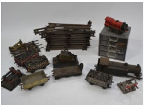
466. A Collection of coarse-scale 0 Gauge items , including four wooden open wagons (three hand finished in Reading Co-op, Bassett-Lowke and Parkend liveries), a modified B-L 0-6-0 tank loco body only, a Chad Valley red 3402 clockwork locomotive, early Bing GW tender, part-dismantled B-L or similar LMS black tender, a small 4-drawer unit of cast chairs and other track components, Hornby brass buffers and other items, a small quantity of Hornby clockwork track and an assortment of old buffers, varying P-G (qty) £50-70