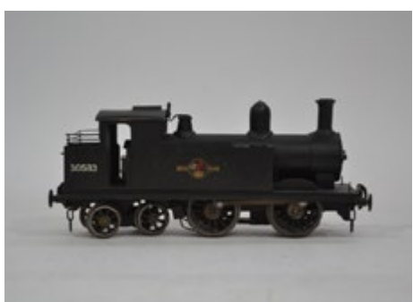
465. A modern 0 Gauge 2-rail Freelance BR 0-4-4T Locomotive by unknown maker , with steel wheels, substantial motor with worm drive, finished in plain BR black with late totem and no 30583, G, bogie fixing nut missing £80-120