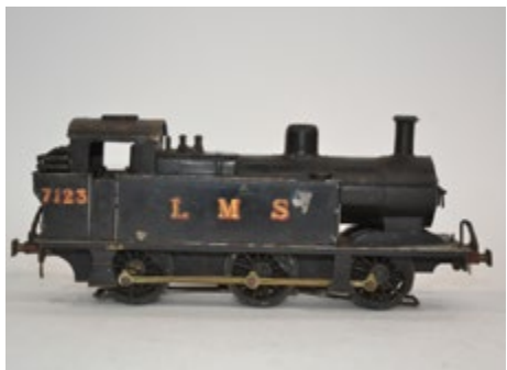
463. A Leeds Model Co 0 Gauge 3-rail 0-6-0 'Jinty' Locomotive , in original LMS black as no 7123, with pre-war LMC mechanism and modified pick-up arrangement, F, paint flaking in places esp left tank, rusting to cab roof, coal rails added to bunker, one foot-step and one chassis-fixing screw missing £60-80