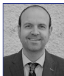
Dominic Foster Toys