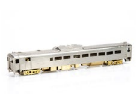
453. NJ International Custom Brass Korea American HO Gauge Budd Rail Car , a boxed RDC 1 Budd Rail Car nickel plated silver finish, retailed by M.G. Sharp Models Sheffield, E, Box F-G £50-80