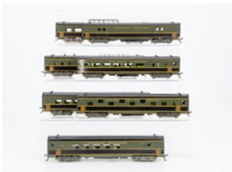
451. Tenshodo Japan Rake of Seven Brass American HO Gauge Canadian National Coaches , all boxed with original packaging, finished in green/black/gold Canadian National livery 423 Baggage, 424 Coach, 425 Diner, 426 Sleeper, 427 Observation, 428 Vista Dome and 429 Combination all with fitted interiors, E, Boxes G, (7) £300-500