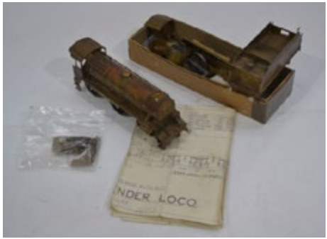
467. Two part-completed Finescale 0 Gauge brass SR 4-4-0 Locomotives , a substantially-complete but unpainted SR 'Schools' class 4-4-0 and tender, with part of a Vulcan gearbox fitted but no motor, various finishing parts included in a bag (slide bars, smoke deflectors etc.), together with a less-complete T9 locomotive only from Charles Covey (Models), comprising only frames with driving wheels, cab, smokebox parts and boiler fittings (other parts not present), overall F-G (qty) £80-120