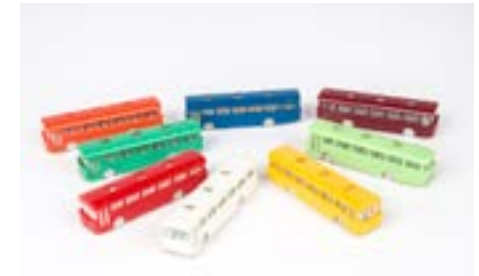
595. Tri-ang Minix 00 Gauge loose RC 14 AEC Strachans Bus, eight models including maroon and two types of green, VG (8) £60-80

594. Tri-ang Minix 00 Gauge loose RC 13 Ford 15 CWT Van, ten models including maroon, three types of green and orange, VG (10) £60-80