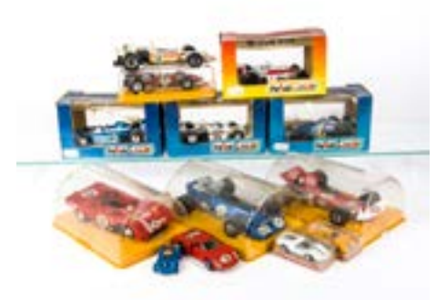
939. Polistil Competition Cars, A collection of vintage models 1970S/80s including Cased 1:25 scale examples, cased and boxed 1:32 scale models two cased 1:66 scale models and three unboxed, P-G, Boxes P-F (13) £50-80

938. Packaged Competition and Road Cars, A collection of 1:43 scale and smaller modern vehicles including Formula 1, examples by Matchbox, Hotwheels, Atlas Editions, Teamsters, Majorette and others, E, Packages F-G, (30+) £50-80