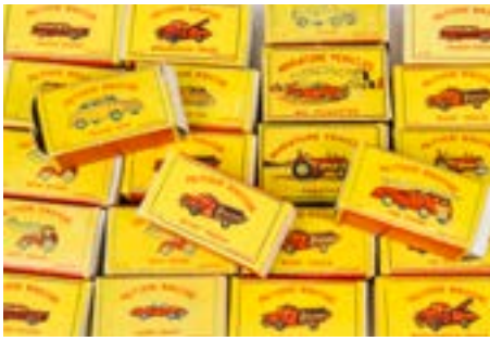
457. Polythene Miniatures (Hong Kong) Matchbox 1-75 Series Copies, including Fire Engine, MG Roadster, Breakdown Truck, Dump Truck, Station Wagon, Tractor and others, in original boxes, VG-E, boxes F-VG (20+) £50-70

456. Polythene Miniatures (Hong Kong) Matchbox 1-75 Series Copies, including MG Roadster, Breakdown Truck, Dump Truck, Station Wagon, Ford Customline and others, in original boxes, VG-E, boxes F-VG (20+) £50-70