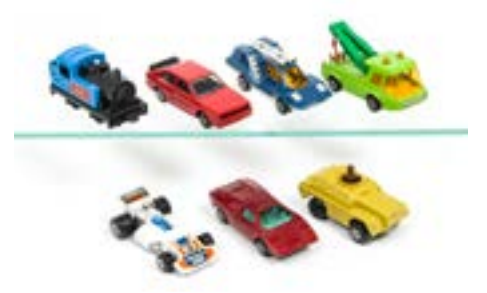
124. Loose Matchbox Superfast Brazilian Issues , 74 Toe Joe, 36 Formula 5000, 28 Stoat, 68 Cosmobile, Audi Quattro, 27 Lamborghini Countach, 43 Loco, G-VG (7) £60-80

123. Loose Matchbox Superfast Brazilian Issues, 68 Cosmobile, 14 Mini Ha-Ha, 35 Fandango, 57 Wild Life Truck, 54 Ford Capri, The Londoner, 29 Racing Mini, Flat Car, P-G (8) £60-80