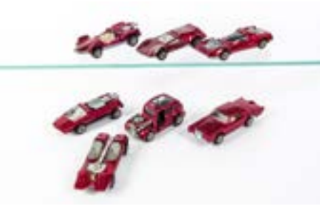
425. HotWheels Redlines, Splittin Image, Hairy Hauler, Cockney Cab, Custom Continental Mk III, Tri-Baby, Mantis, Mod Quad, all in spectraflame rose/reds, F-E (7) £80-120

424. 1980s Blister Packed HotWheels, including 3292 Renault Le Car (2), 3287 Fiat Ritmo, 3281 Peugeot 505, 3290 Rolls Royce Phantom Convertible and others, with a three car gift pack, n original blister packs, all made in France, VG-E, boxes P-VG, two opened (9) £100-150