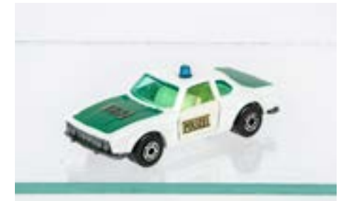
191. Pre-Production Matchbox Superfast 45 BMW 3.0 CSL , white/green body, white 'Polizei' door labels, off-white interior, unpainted base, E £40-60

190. Pre-Production Matchbox Superfast 61 Peterbilt Wreck Truck, blue body, chrome base and interior, black jibs, light amber windows, E £40-60