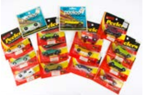
468. Playart (Hong Kong) 1/64 Peelers Blister Packs, including Honda Z GS, Mercedes-Benz 350SL, Javelin SST, Rolls Royce Silver Shadow, Citroën CX2200 and others, in original blister packs, E, boxes F-VG, two opened (15) £100-150

467. Hong Kong Plastic Vehicles, including NMP Commercial Vehicles Set, Kelly Series Plastic Farm Vehicles, Gordy International Gas Station Set, Gordy Mite Trucks (4) and other items, G-E, boxes P-G (14) £80-120