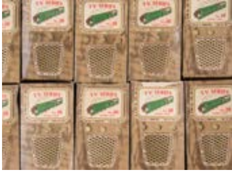
884. Benbros TV Series Express Locomotives, 32 models in various colours, all in original boxes, VG-E, boxes G-VG (32) £60-80

883. Various makers Die-cast Cars and Commercials, Auto Pilen 305 Mercedes 250 Coupe black and yellow Taxi and 329 Seat 124 Sport Coupe in metallic deep red finish (rear wheels pushed up), Inter Cars 102 Ford Mustang in silver, Matchbox MOY No 7 Allchin Traction Engine, all in original boxes, unboxed Corgi Commer 5-Ton Flat bed, Matchbox 1:75 Austin A50 and Timpo Toys red saloon car, Timpo F others VG-E, boxes G-VG MOY unattached tab and flap in box (7) £60-80