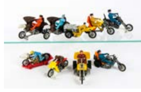
418. HotWheels Motorcycles, including Rrrumblers Bold Eagle (2), Roamin Candle, 3 Squealer, Rip Snorter, Mean Machine, Torque Chop, Chopcycles Speed Steed and a Corgi Juniors Stunt-Bike, F-G (9) £100-150

Ford Escort, Mustang Stocker, Z Whiz, Spoiler Sport, Upfront 924, Lowdown, Camaro Z28, Show Hoss and others, F-VG (40) £100-150