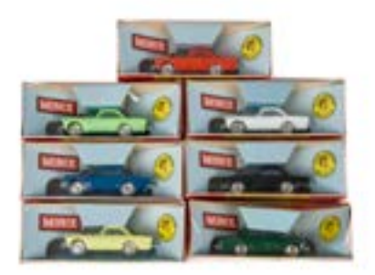
622. Tri-ang Minix 00 Gauge Individually boxed RC 7 Sunbeam Alpine, seven models including black, all in sealed boxes, E, boxes VG (7) £70-90

621. Tri-ang Minix 00 Gauge Individually boxed RC 6 Ford Corsair, eight models, all in sealed boxes, E, boxes VG (8)) £80-100