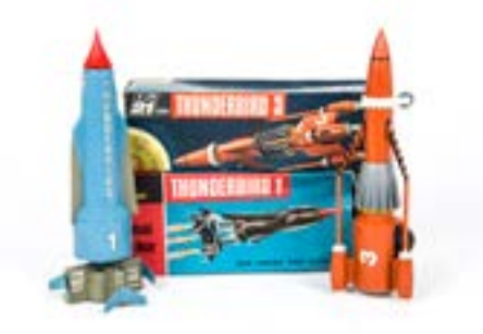
739. J Rosenthal Thunderbird Toys, JR21 Thunderbirds 3, in red plastic body, friction drive motor, Thunderbird 1, blue body, grey wings, red nose cone and wheels, friction drive, both in original boxes, G-VG Thunderbird 1 with one rear fin glued, boxes F (2) £100-150

738. Product Enterprise Limited Supermarionation Replica Collection Signature Edition Thunderbirds 'FAB 1', unused, Certificate No 558, in original box, E, box G-VG £200-300