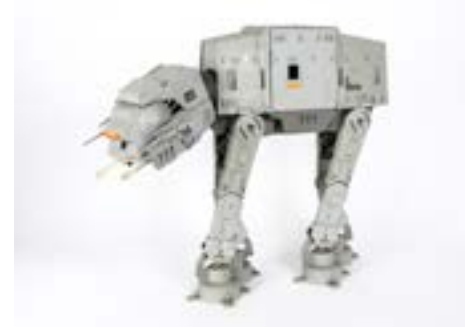
774. Star Wars AT-AT Walker, A 1981 Lucasfilm AT-AT Walker Toy No 38810 by Kenner, complete with nose guns, G £50-80

773. Vintage Kenner Star Wars ROTJ Imperial Shuttle, in original box, VG, box VG, no inner packing or instructions, token removed £150-250