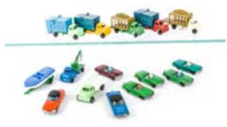
357. Lone Star Tuf Tots unboxed Vehicles, City Refuse Lorries (3), Circus Trucks (2), Boats on Trailers (2), Tankers (2), Breakdown Truck, Cement Mixer, Tipper Truck, 280SL Sports Cars (7), Citroën Convertible (3, one with hood), Corvette (2) and Dodge Dart, one poor otherwise F-VG (25) £60-80

356. Lone Star 1:50 Scale Roadmasters, 1476 Rolls Royce, in original window box, Chevrolet Corvair Fire Chief, in original plastic box with card base, seven unboxed models, Dodge Dart (2, one with damaged rear bumper), Citroën DS 19, Cadillac 62 Sedan, Chevrolet Corsair red 'Feuerwehr' and orange (lacks interior), Ford Sunliner Convertible (windscreen damaged), P-E, boxes G-VG (9) £100-140