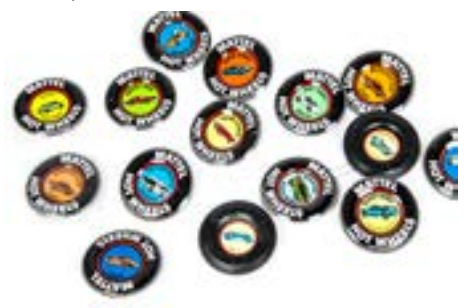
410. HotWheels Tin and Plastic Collectors Badges, including Paddy Wagon, Ferrari 312P, Nitty Gritty Kitty, Sand Crab and many others, G-E (50+) £50-70

409. Italian Issue HotWheels 24 Car Collectors Set, cardboard fold out case with twenty four HotWheels issues, all in original blister packs, including 3258 Aries Wagon, 1691 Cannonade, 1700 Mirada Stocker, 2501 Royal Flash, 2014 Hot Bird, 2510 Inside Story, 3261 SEL 380 and others, E, contents probably original to case but unconfirmed, case G, blister packs, F-VG £100-150