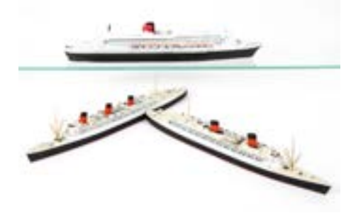
663. Various makers Cruise Liners 1:1200 metal and resin waterline models, CM KR Queen Mary 2, Mercator Queen Mary and Queen Elizabeth, VG-E (3) £60-80

662. Various makers Cruise Liners 1:1200 metal and resin waterline models, metal, Skytrex Grand Princess, Mercator Sun Princess, CM KP Voyager of the Seas, CFC Silja Seranade, B1 Aida and resin CA 1001 Oosterdam, generally VG-E, a few small pieces loose (6) £100-140