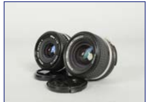
398. Two Nikon Nikkor 28mm Wide Angle Lenses , a 28mm f/2 AIS lens, barrel G, elements G, fungus to rear element and a 28mm f/2.8 series E lens, barrel G, elements G £60-80