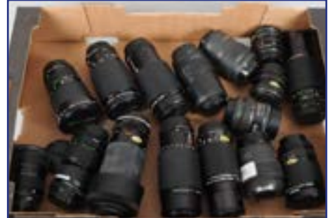
446. A Tray of Pentax Zoom Lenses , including, 28-50mm f/3.5-4.5, 35-70mm f/3.5-4.5, 24-35mm f/3.5, 28-80mm f/3.5-4.5, 70-210mm f/4, 35-210mm f/3.5-4.5, 28-135mm f/4 and other examples, 16 intotal £80-120