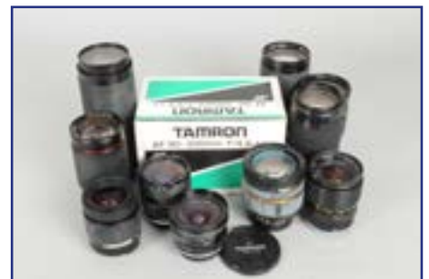
422. A Tray of Nikon Mount Tamron Lenses , including, a 24-135mm f/3.5-5.6 SP aspherical lens, boxed 90-300mm f4.5-5.6 AF lens, 35-105mm f/2.8 SP AF lens and other zoom lenses, overall G £100-200