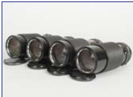
20. Four Canon FDn 70-210mm f/4 Zoom Lenses , macro capability, maker's front and rear caps, one with BT-58 lens hood £40-60