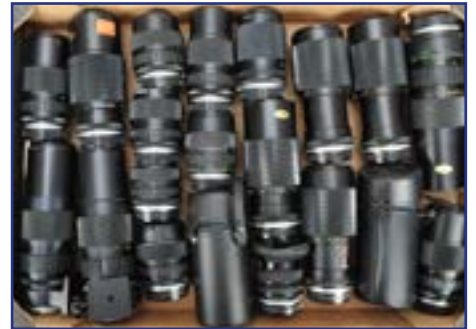
458. Olympus OM-System Zoom Lenses , various focal lengths, overall G-VG, twenty in total £150-200