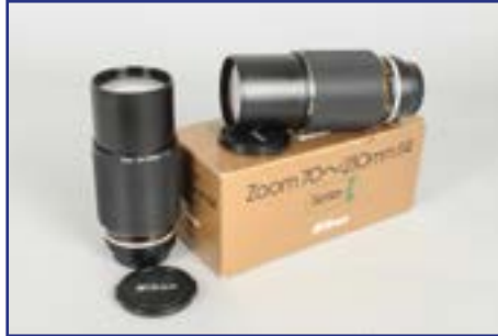
417. Two Nikon Series E 70-210mm f/4 Lenses , serial no's 2073036, 1842859, one in makers box, both with caps, overall G-VG £40-60