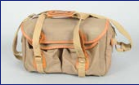
388. A Billingham Camera Bag , Cordura, tan, 38x23x25cm (aprox) two front pockets, one larger zipped front pocket, zipped back pocket, leather trim, cloth handles, shoulder strap, some marks, some wear to bottom £50-70