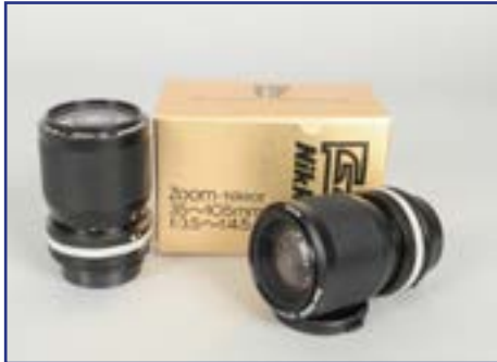
413. Two Nikon Zoom-Nikkor 35-105mm f/3.5-4.5 AI-S Lenses , serial no's 2168433, 1833018, one in makers box, with caps, overall VG-E £40-60