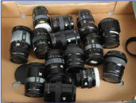
437. A Tray of Minolta AF Zoom Lenses including, 24-50mm f/4, 28-80mm f/4-5.6, 28-85mm f/3.5-4.5 (5), 28-135mm f/4-4.5, 28-105mm f/3.5-4.5, 35-105mm f/3.5-4.5, 35-70mm f/4, 35-105mm f/3.5-4.5 (3) and 80-200mm f/4.5-5.6, G £70-90