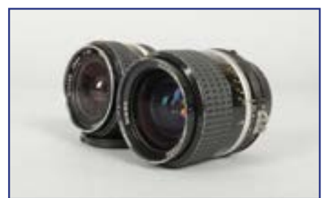
397. Two Nikon Nikkor 28mm wide Angle Lenses , a 28mm f/2 AIS lens, barrel F, elements G and a 28mm f/3.5 AI lens, barrel F, elements P-F £50-70