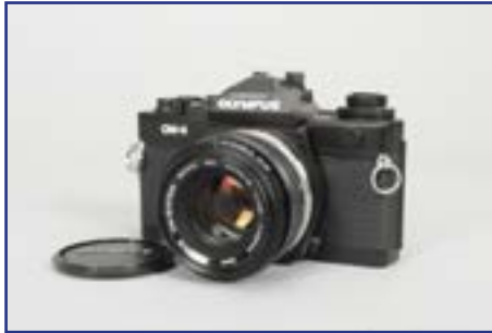
454. An Olympus OM-4 SLR Camera black, shutter working, meter responsive, body G-VG, with Zuiko auto-s 50mm f/1.8 lens, barrel VG, elements G, internal dust, with lens cap £80-120