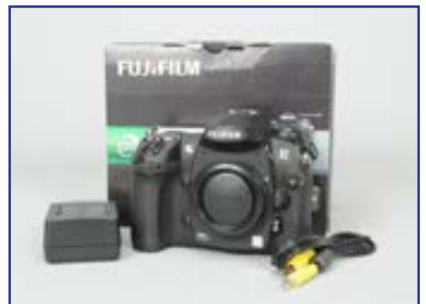
333. A Fujifilm Finepix S5 Pro DSLR Body , no. 73Q03754, condition VG, with 2 batteries, charger, instructions, software CD, strap, maker's box, untested £80-120