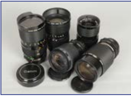
14. Five Canon FDn Short Zoom Lenses , a 28-85mm f/4 lens with macro, a 35-70mm f/2.8-3.5 lens with macro, a 35-70mm f/4 lens, a 35-105mm f/3.5-4.5 lens with macro and a 50-135mm f/3.5 lens with macro £50-80