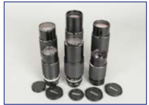
420. Six Nikon Zoom-Nikkor Lenses , two series E 75-150mm f/3.5 AI-S lenses, G-VG, two 80-200mm f/4 AI-S lenses, G-VG, one 80-200mm f/4 AI lens, G and one 100-300mm f/5.6 AI-S lens, G-VG £80-120