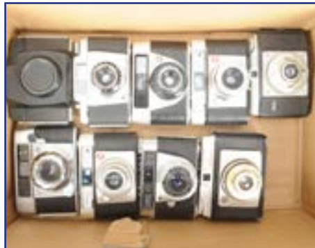
307. Nine Viewfinder Cameras , comprising an Agfa Optima, an Agfa Silette, a Digna Certex, Ilford Sporti, a Kodak Brownie 44A, a Kodak Retina Automatic II, a Regula Sprinty BC, a Werlisa Color, a lot £30-50