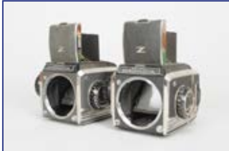
483. Two Zenza Bronica S2 Camera bodies , shutters fire, with backs, one with broken mirror, AF £40-60