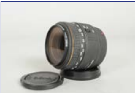
439. A Sigma EX 50mm f/2.8 Macro Minolta Mount Lens , barrel VG-E, elements VG-E, with caps £40-60