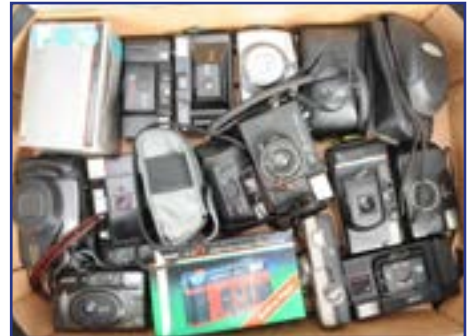
322. A Tray of Compact Film Cameras, brands include Konica, Minolta, Olympus, Pentax, Samsung and Yashica, A/F £30-50