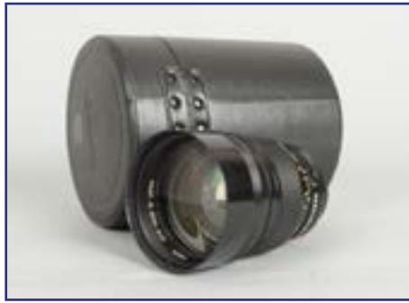
18. A Canon FDn 135mm f/2 Lens , serial no. 26683, body F-G, elements VG, with maker's case £100-150