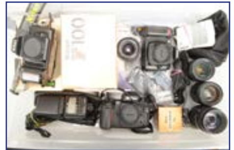
473. Nikon Cameras and Lenses , including, F100 body (boxed), F-601AF (boxed), D50, with leads, batteries, charger, Nikkor 70-200mm f/4-5.6 AF, 35-70mm f/2.8 AF, 35-70mm f/3.3-4.5 AF, 24-50mm f/3.3-4.5 AF lenses, SB-28 flash, extension ring and other items £120-180