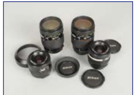
411. Four Nikon AF-Nikkor Zoom Lenses , two 35-70mm f/2.8, two 35-70mm f/3.5-4.5 lenses, overall G-VG £40-60