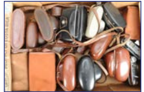
310. Various Mid Century Cameras , brands include Agfa, Agilux, Arette, Bencini, Bilora, Exa, Kodak, Yashica, Voigtlander, A/F £30-50