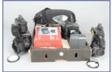
332. Sony and Other Video Equipment , a Sony CCD-V5000E digital Hi 8 video camcorder, a Sony Handycam CCD-V800E video Hi 8 camcorder, a Ferguson Videostar S-VHS-C FC23 camcorder, a Tamron Fotovix slide to video transfer unit and a Hama Telescreen Video film to video back projection screen and 10 sealed unused Panasonic Mini DV blank tapes, all untested £40-60