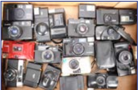
316. A Tray of Rollei and Other Compact Cameras, including a Rollei XF35, a Rollei A26, a Rollei B35, a Minox 35ML, a Minox GT-E, an Olympus XA1, an Olympus XA2, other brands include Canon, Minolta, Pentax and Yashica, A/F £40-60