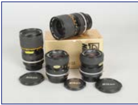
412. Four Nikon Zoom Nikkor 35-70mm Lenses , two 35-70mm f/3.5 AI-S lenses and two 35-70mm f/3.3-4.5 AI-S lens, one in makers box, overall G-VG, with caps £70-90