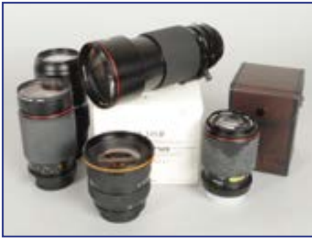
424. Nikon Mount Tokina Lenses , including, 20-35mm f/3.5-4.5 AF 235 II, 80-200mm f2.8 AT-X SD, 70-210 f/4.5 AF and two AI-S zoom lenses, overall G £70-90