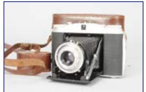
150. An Agfa Isolette II 6 x 6cm Folding Camera , Pronto shutter, shutter working on single speed (1/50s?) only, Agfa Apotar 85mm f/4.5 lens, camera G, lens G, with accessory rangefinder and maker's leather ERC £20-30