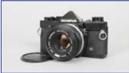
450. An Olympus OM-1n MD SLR Camera , black, shutter working, body G-VG, with Zuiko auto-s 50mm f/1.8 lens, barrel G-VG, elements G, slight fungus to front element, internal dust, with lens cap £40-60