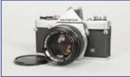
449. An Olympus OM-1n MD SLR Camera , chrome, shutter working, body G, with Zuiko 50mm f/1.4 lens, barrel VG, elements G, dust or oil spotting to front element, with lens cap £40-60