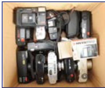
303. Viewfinder Cameras and Electronic Flashguns , brands include Hanimex, Kodak, Minolta, Olympus, Pentax, Praktica, Rank Aldis, Yashica and Canon Speedlite £30-50