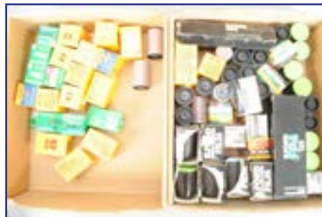
468. 35mm Film Stock , mostly dated circa 2000's, including Ilford FP4 black & white film (16 aprox) HP5 (20 aprox), various Kodak films and others £60-80