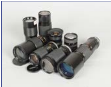
21. A Tray of Independent FD Mount Lenses , including a Sirius 18-28mm f/4-4.5 zoom lens, a Tamron SP 24-48mm f/3.5-3.8, 35-210mm f/3.5-4.2, zoom lenses with Adaptall 2 adapters, a Tamron 35-135mm f/3.5-4.5 zoom lens with Adaptall 2, a Hoya 80-205mm f/3.8 zoom lens, a Vivitar 200mm f/3.5 lens, a Sun 300mm f/4.5 lens and an APO-Sigma 400mm f/5.6 lens £40-60