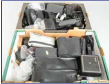
429. Two Trays of Nikon Accessories , including, flash units, hoods, battery packs, cables and other items £70-90