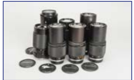
497. SLR Lenses , Olympus Zuiko - f/4 65-200mm zoom, f/4 200mm (3), Minolta - f/3.5 50-135mm MD zoom (2), f/4 70-210mm AF zoom (7) £70-100