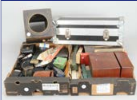
490. Lenses and Slide-Rules , including a Leitz Elmar 90mm f/4 lens, no. 1700702, 1959, a Robot Schneider-Kreuznach Tele-Xenar 75mm f/3.8 lens, a number of slide-rule calculators an EP magic lantern and slides outfit in box and other items, A/F £50-80