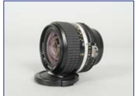
396. A Nikon Nikkor 24mm f/2.8 Wide Angle AI-S Lens , serial no 832294, barrel G-VG, slight marks to mount ring, elements G, fungus to rear element, with caps £60-80