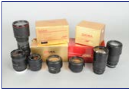
440. A Tray of Sigma Minolta Mount lenses , including, 28mm f/1.8 AF, 70-300mm f/4-5.6 APO macro, 75-300mm f/4.5-5.6 APO AF, 75-300mm f/4.5-5.6 AF for Minolta a, all in makers boxes, 28mm f1.8 high speed wide aspherical (2) and other lenses, G-VG £80-120