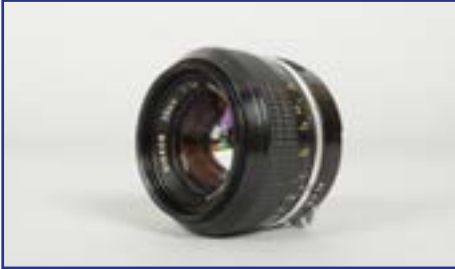
400. A Nikon Nikkor 50mm f/1.4 Non AI Lens , serial no 2803438, Barrel G-VG, slight marks to mount ring, elements G, some internal dust, slight haze £40-60