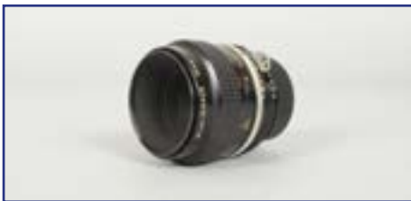
402. A Nikon Micro-Nikkor 55mm f/3.5 AI Lens , serial no 852354, barrel G, scratches to filter ring, element G, internal dust £60-80