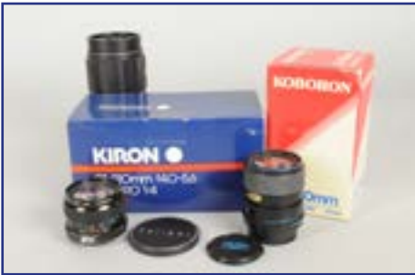
426. Nikon Mount Lenses , including 28-70mm f/3.5-4.8 Jenazoom II AI-S, Soligor 300mm f/3.5 tele-auto non AI, Kiron series Z 28-210mm f/4-5.6, 28mm f/2.8 and Koboron 24-70mm f/3.5-4.8, overall G-VG £60-80