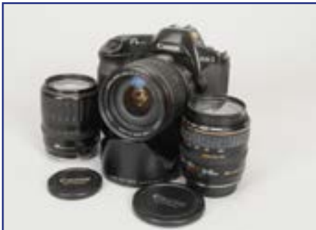
480. A Canon EOS-1 Camera , with, EF 28-135mm f/3.5-5.6 IS Ultrasonic, EF 28-105mm f/3.5-4.5 Ultrasonic, 35-135mm f4.5.6 Ultrasonic lenses, overall G-VG £100-150