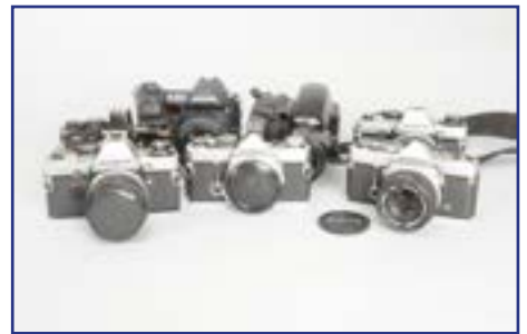
499. Olympus SLR and Digital Cameras , black OM2N body, OM2 body, OM10 with f/1.8 50mm lens (2), OM1 MD with f/1.8 50mm lens, with IS-1000 and E-1 with f/3.5-5.6 14-42mm lens, some a.f. (7) £80-120