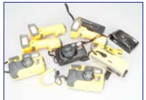
311. Sea & Sea Cameras and Lights , comprising two Motor Marine 35 underwater cameras, three YS-40A lights, a Minolta Weathermatic A camera and other items, a lot £20-30