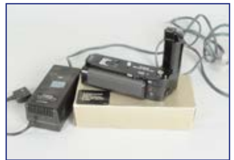
25. A Canon Motor Drive MA , requires 12 X AA batteries or Ni-Cd Pack, together with a Canon Ni-Cd Pack MA and a Canon Ni-Cd Charger MA, all untested £40-60