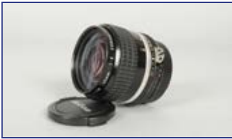
399. A Nikon Nikkor 35mm f/2 AI-S Lens , serial no 258202, barrel G, some scratches, wear, elements G, haze, with caps £50-70