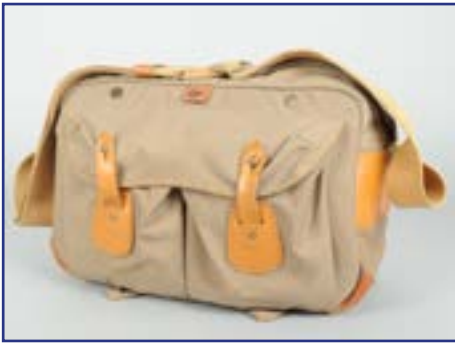
387. A Billingham Camera Bag , Cordura, tan, 36x24x15cm (aprox) two front pockets, one zipped back pocket, leather trim, cloth shoulder strap, some marks, some wear to bottom £40-60