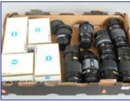
436. A Tray of Minolta AF Zoom Lenses , including, 35-105mm f/3.5-4.5 (3), 28-135mm f/4-4.5, in makers boxes, 28-135mm f/4-4.5 (4), 35-200mm f/4.5-5.6 and 75-300mm f/4.5-5.6, G £70-90