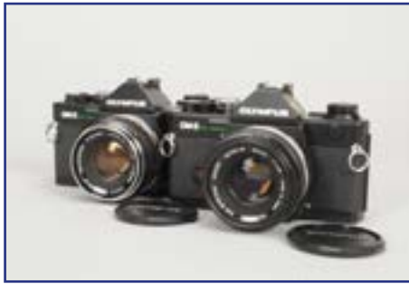
453. Two Olympus OM-2 Spot/Program SLR Cameras , shutters working, slight lifting to leatherette on one body, other VG, both with 50mm f/1.8 lenses G-VG £70-90