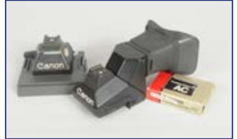
23. A Canon Speed Finder FN and AE Finder FN , for Canon F-1 New, Speed Finder, with rubber eyecup, AE Finder, dent to top of housing, heavy wear, optics cloudy, plastic storage base and a Focusing Screen FN in box, A/F £50-80