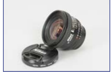
472. A Nikon Nikkor 20mm f/2.8 Wide Angle Lens , elements G-VG, some internal dust, barrel G-VG, with caps £100-150