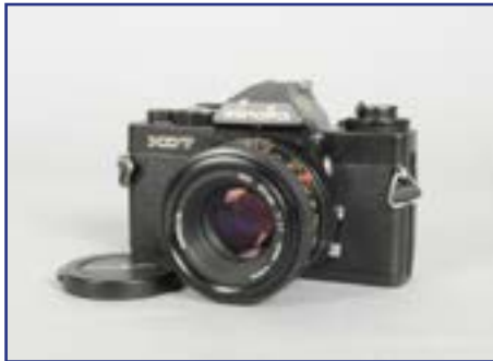
430. A Minolta XD7 SLR Camera , black, shutter working, body VG, with 50mm f/1.7 MD lens, barrel VG, elements VG, some internal dust £50-70