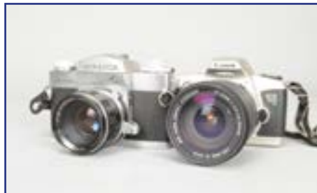
146. A Miranda Sensorex II SLR Camera , no. 8317153, shutter working, meter responds to light, body G-VG, an Auto Miranda 50mm f/1.8 lens, G, edge haze, a Canon EOS 500N SLR camera with a Sigma 28-200mm f/3.5-5.6 lens, untested £30-50