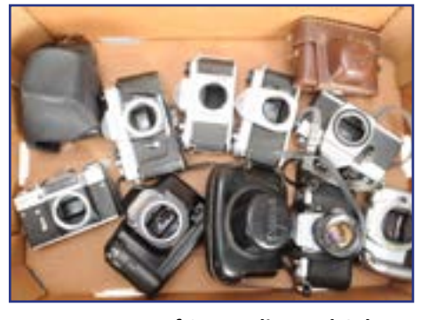
321. A Tray of SLR Bodies and Other Cameras, SLR bodies include Asahi Pentax (3 examples), Canon, Praktica, Yashica and Zenit, others include a Canon Canonet and a Taron Marquis, A/F £30-50