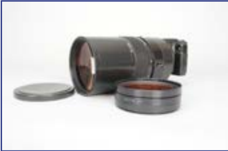
326. A Russian MC MTO 1000mm f/10 Mirror Lens , serial no. 961252, M42 mount, barrel G, elements G, front and rear caps, together with a Zenit 122 SLR body £100-150