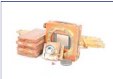
327. A Thornton-Pickard Imperial Triple Extension Field Camera , half-plate, with a Busch Rapid Symmetrical f/8 lens, a Thornton-Pickard roller blind shutter, six mahogany plate holders, tripod legs and a Sands Hunter cloth case £150-250