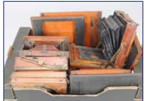
488. Mahogany and Brass Camera Bodies and Parts , including a Thornton-Pickard Amber whole plate view camera body, other folding camera bodies and parts £60-80