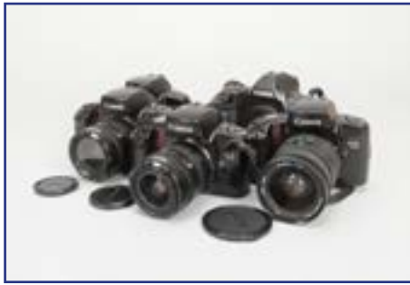
481. Canon EOS Cameras , An EOS 100 with 28-70mm f/2.8 Sigma AF lens, EOS 100 with 28-70mm f/3.5-4.5 EF lens, EOS 100 with 28-70mm f/3.5-4.5 EF lens and EOS 3, EOS 100 bodies £40-60