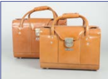
390. Two Nikon Outfit Cases , FB-11, with inserts, some marks, minor scuffs and FB-15, with inserts, some slight wear £40-60