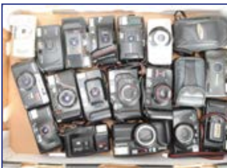
320. A Tray of Nikon and Other Compact Cameras, including a Nikon TW Zoom105, a Nikon AD3, a Nikon RF, other brands include Canon, Olympus and Yashica, A/F £40-60