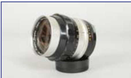
403. A Nikon Nikkor-P Auto 105mm f/2.5 Non AI Lens , Nippon Kogaku, serial no 126867, barrel F-G, small ding to filter ring, scratches, wear to focus ring, some brassing to mount ring, elements G, internal dust, with rear cap £60-80