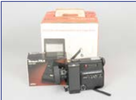
328. A Canon Canosound Cine Camera and Accessories , a Canon Canosound 514XL-S Super 8 sound cine camera, 9-45mm f/1.4 lens, a Rank Aldis Dual Cine Editor and a Braun FK4 automatic tape splicer, editor and splicer in maker's boxes, untested £20-30