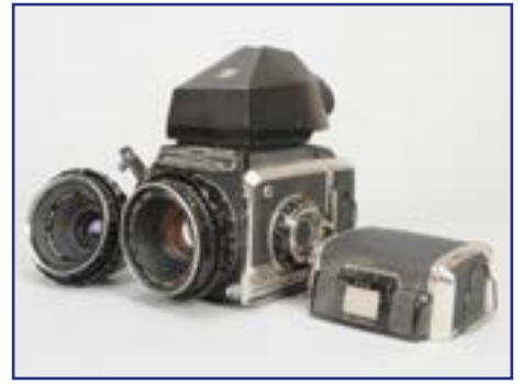
485. A Zenza Bronica S2 Camera , shutter firing, with Zenzanon MC 80mm f/2.8, F, Nikkor-P 75mm f/2.8, F, lenses, prism viewfinder, spare back, overall F-G £50-70