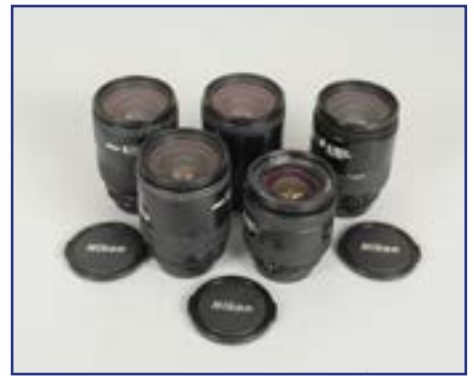
408. Nikon AF Nikkor Zoom Lenses , four 28-85mm f3.5-4.5 lenses, One 24-50mm f/3.3-4.5, Overall G-VG, with caps £80-120