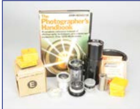
145. A Kern-Paillard Switar 25mm f/1.4 Rx Cine Lens , no. 447158, with front and rear caps, a Wray Supar 4 1/4 in. f/4.5 enlarging lens, three projection lenses and other items £40-60