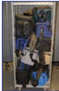
392. A Large Selection of Camera Bags , manufacturers include, Tenba, Lowpro, Senator, C.C.S and many generic cases £50-70