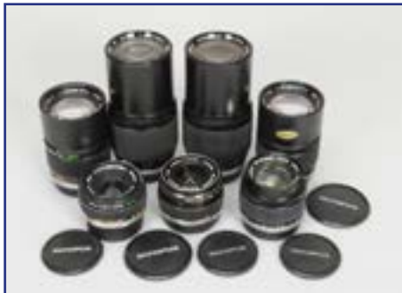
456. Seven Olympus Prime Lenses , an auto-w 35mm f/2.8, auto-s 50mm f/1.8, auto-t 100mm f/2.8, two auto-t 135mm f/2.8, two auto-t 200mm f/4, overall G-VG, with caps £100-150