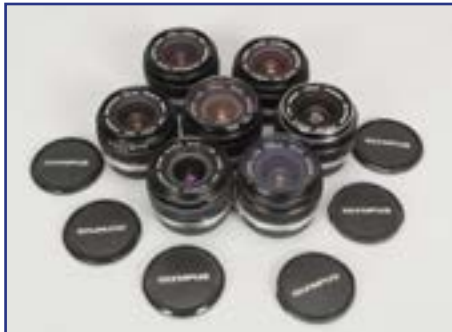
455. Seven Olympus OM-System Auto-W Wide Angle lenses a 35mm f/2.8, two 24mm f/2.8, four 28mm f/2.8, barrels G-VG, elements G, with caps £100-200