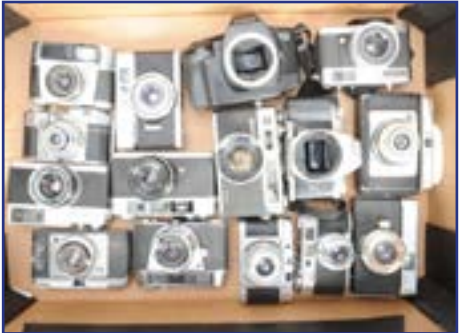
314. A Tray of Viewfinder Cameras, 15 cameras including an Agilux Agimatic, a Kodak Retina Automatic I and a Retina S1, a Konica 261 Auto S, a Yashica Electro 35 and a EZ-matic 4 and a Seagull 205, A/F £30-50