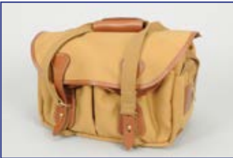
463. A Billingham Camera Bag , canvas, tan, 33x25x24cm (aprox), 1115 inner, slight mark on back, overall VG £50-70