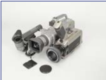
330. A Sony DCR-VX9000E PAL Digital Camcorder , DV digital video camera cassette recorder, 3 CCD, a Sony 5.9-59mm f/1.6 zoom lens, an Sony AC power adapter, a 0.5 wide-angle attachment lens and maker's instructions, no battery, a JVC GX-88E PAL colour video camera, TV zoom lens 12-72mm f/1.4, all untested £40-60