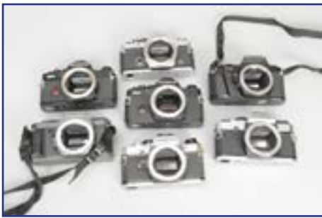
298. Seven SLR Bodies , comprising an Olympus OM-2 MD, two OM-2 Spot/Programs, an OM10, an OM20, a Pentax P30 and a P30T, a lot £40-60