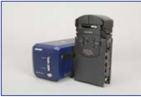
476. A Plustek Opticfilm 7400 Image Scanner , with cables, manuals and a Fujifilm Digital FV-10D photo-video manager, with cables, manuals, untested £60-80