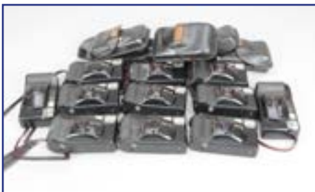
301. Eleven Canon Sure Shot Compact Film Cameras , ten Sure Shot Supreme and a Sure Shot Supreme Quartz Date, seven with cases, some with missing battery covers, a lot £30-50