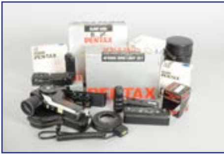
448. Pentax Accessories , including, a spotmeter, data back, motor drives, cases and ring flares £30-50