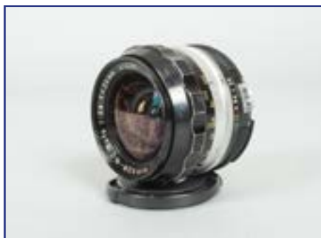
394. A Nikon Nikkor-N.C Auto 24mm f/2.8 AI Wide Angle Lens , serial number 410281, barrel G, wear to focus ring, scratches, elements F-G, fungus, some scratches, with front cap £40-60