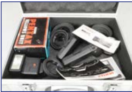
140. Pentax Accessories , an M42 Asahi Pentax Bellows Unit, two Pentax Winder ME II power winders, a Pentax AF200S electronic flash, a Pentax eyepiece magnifier, all in an aluminium case £30-50