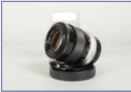
404. A Nikon Nikkor-Q Auto 135mm f/2.8 Non AI Lens , serial no 189549, barrel G-VG, elements G-VG, some internal dust, with cap, in makers bubble £40-60