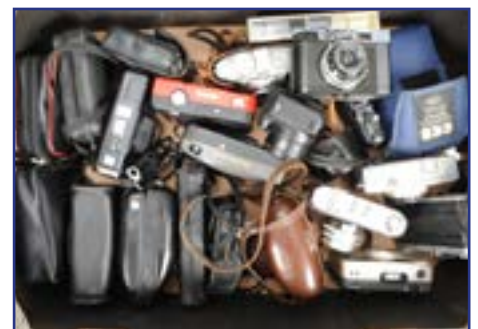
312. An Assortment of Cameras , brands include Agfa, Canon, Chinon, Cosmic, Fujica, Fujifilm, Halina, Kodak, Opus, Prinz, Voigtlander, A/F £30-50