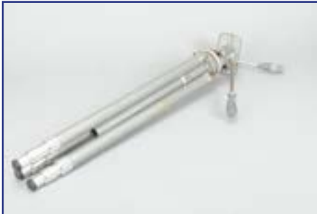
479. A Gitzo Cremalliere Tripod , with ratcheted center column, pan an tilt R.no 3 head, G £40-60