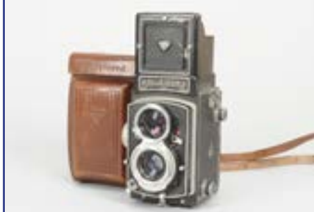
482. A Rolleicord V TLR Camera , shutter sticking, with Schneider Kreuznach 75mm f/3.5 lens, elements F, some lifting to leatherette, scratches to top, in case £50-70