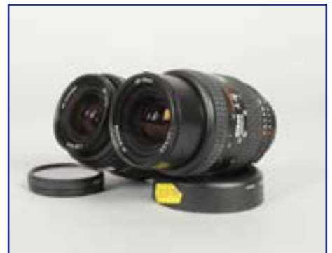
410. Two Nikon AF Nikkor 28-70mm f/f3.5-4.5D Lenses , barrels, G, light wear, one with fungus to element, overall G £30-50