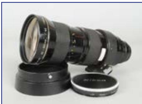
415. A Nikon Zoom Nikkor 50-300mm f/4.5 ED AI Lens , serial no 175640, barrel F-G, light scratches, wear, brassing to mount ring, elements G-VG, some internal dust, with caps, lens hood, L39 filter, in worn case £120-180