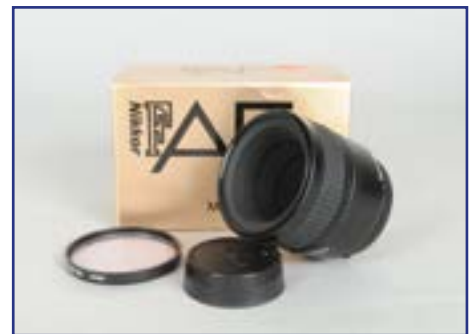
421. A Nikon Micro Nikkor 60mm f/2.8 Lens , barrel VG, light marks, elements VG, some internal dust, with manual in makers box £80-120