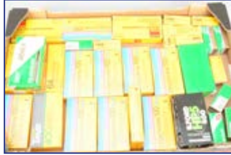
467. 120 Film Stock , Dated 91-99, including Ektachrome 100 plus aprox 50 films, Vericolor II professional 10 films, Kodak Tmax 400 5 films, Ektachrome 160 9 films, Fujifilm, Ilford, all unopened £80-120