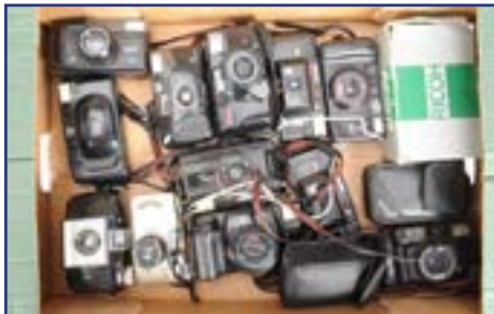
319. A Tray of Auto Focus Compact Cameras, brands include Canon, Chinon, Fuji, Goldline, Halina, Minolta, Miranda, Nikon, Olympus and Ricoh, A/F £30-50