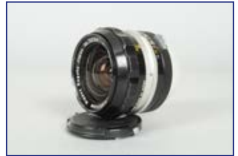
395. A Nippon Kogaku Nikkor-N Auto 24mm f/2.8 Non AI Wide Angle Lens , serial number 262266, barrel G, slight wear to focus ring, elements, G, some haze, with front cap £40-60