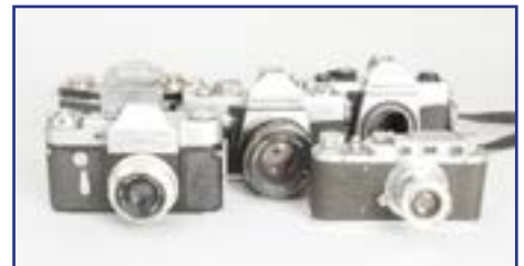
500. Eastern Bloc Cameras , Ihagee, FED 1 Leica-copy, Zenit 3M, Praktica MTL3 with Pentacon f/8 50mm lens, MTL5B, Carl Zeiss Jena lenses - Flektogon f/2.4 35mm, Tessar f/2.8 50mm (3) (9) £40-60