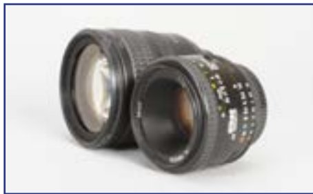
493. Nikkor Lenses , AF-S Nikkor 18-70mm f/3.5-4.5G ED lens, a.f. and AF Nikkor f/1.8 50mm lens, a.f. (2) £40-60