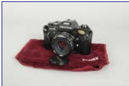
443. A Pentax Super A SLR Camera , black, shutter working, body VG-E, with 50mm f/1.7 SMC lens, barrel VG, elements G-VG, some internal dust £60-80