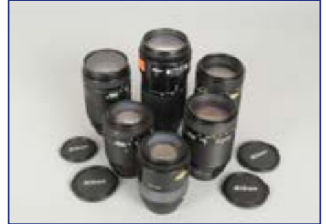
409. Nikon AF Nikkor Zoom Lenses , two 35-105mm f/3.5-4.5, one 35-135mm f/3.5-4.5, two 70-210mm f/4-5.6, one 70-210mm f/4, all with caps, overall G-VG £100-150