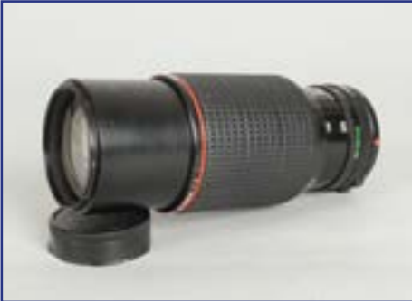
16. A Canon FDn 80-200mm f/4 L Zoom Lens , serial no. 10399, with macro, barrel F-G, elements G-VG, no front cap £60-80