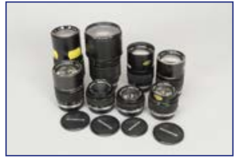
457. Eight Olympus OM-System Prime Lenses an auto-macro 50mm f/3.5, auto-s 50mm f/1.8, auto-t 100mm f/2.8, three auto-t 135mm f/2.8, auto-t 180mm f/2.8, 200mm f/4, overall G-VG, with caps £100-150