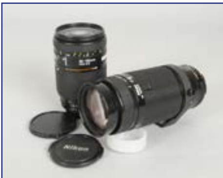
414. Two Nikon AF Nikkor Zoom Lenses , a 75-300mm f/4.5-5.6 lens, and a 35-135mm f/3.5-4.5 lens, overall G-VG £60-80