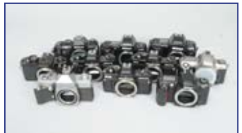
335. Nikon and Praktica SLR Bodies , including a black Nikon FM, an F-301, an F-801s, an F90X, two F65, two Praktica BCA, a BMS and an MTL3, A/F £40-60