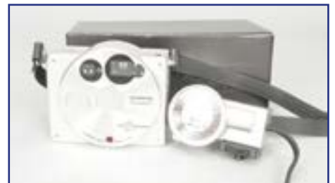
152. An Olympus O-Product 35mm Compact Camera , with an Olympus 35mm f/3.5 lens, body VG, untested, with flashgun, strap, maker's box and instructions £80-120