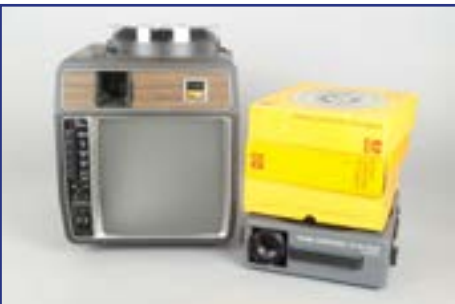
389. Slide Projectors , a Singer Caramate 3300 projector, with built in screen and tape deck, powers up, fan noisy, lamp not working, with manual, microphone, in makers case, a Kodak Carousel S-AV 2020 projector with Schneider 55mm, Kodak 150mm, 70-120 Retinar lenses and fourteen Kodak carousels £50-70