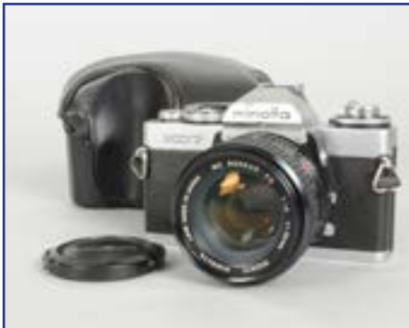
431. A Minolta XD7 SLR Camera , chrome, shutter working, body G-VG, with 50mm f/1.4 MC Rokkor lens, barrel G-VG, elements G-VG, some internal dust £60-80