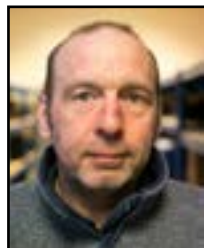
Mike Spencer Cameras