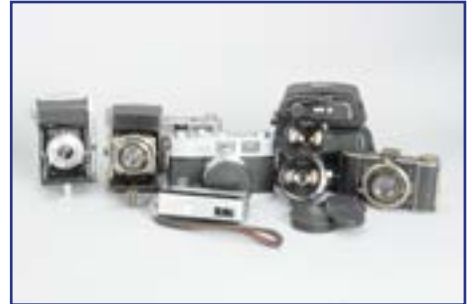
498. Various Cameras and Lens , folding-strut Korelle, Mamiya C TLR f/3.5 65mm lens, Baldwinette, Kodak Retina I with Schneider-Kreuznach Retina-Xenar f/3.5 50mm lens, Mamiya 16, two Mamiya roll-film backs, Leica Digilux 4.3 and three other cameras (12) £100-150