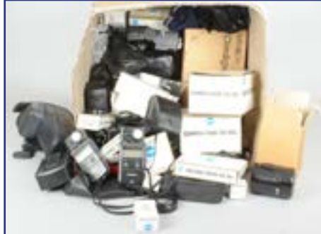
442. A Box of Minolta Accessories , including, two IV flash meters, advanced F-2400 photo scanner, flash units, EB-90 100 exposure back, CG-1000 control grip, convertor kit, cases, battery pack, drives, and more, £60-80