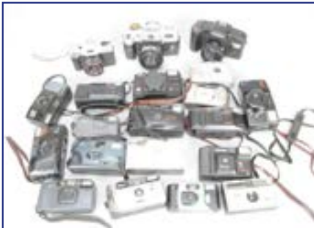
300. A Box of Compact Film Cameras , brands include Halina, Kodak, Miranda, Nikon, Olympus, Photokraft, Sirius, Yashica, £30-50