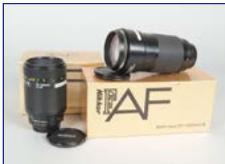
418. Two Nikon AF Zoom Nikkor Lenses , one 70-210mm f/4, one 70-210mm f/4-5.6, both with caps, in makers boxes, with manuals, overall VG £30-50