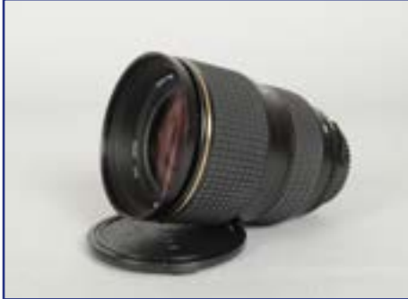
425. A Nikon Mount Tokina AT-X Pro , 28-70mm f/2.6-2.8 AF Lens barrel VG, elements VG-E, with caps £50-70