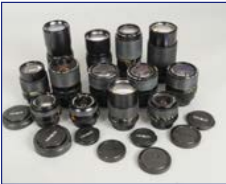
438. Minolta MD Lenses , including, 28mm f2.8, 135mm f/2.8 (2), 135mm 3.5, 200mm f/4, 28-85mm f/3.5-4.5, 35-70mm f3.5 (2), 50-135mm f/3.5 and 75-180mm f4, G-VG £70-90