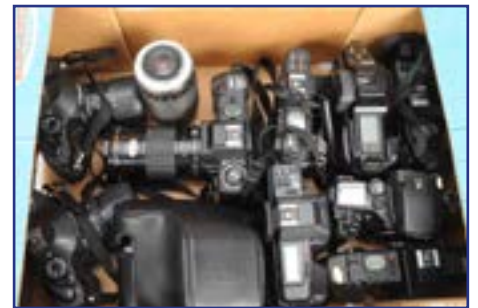
309. SLR Bodies and Lenses , comprising a Canon EOS 30, a Canon T90, a Chinon CP-7m, two Cosina C1's, a Minolta 7000, a Pentax A3, a Ricoh KR-10, a Yashica 230-AF and some lenses, A/F £30-50