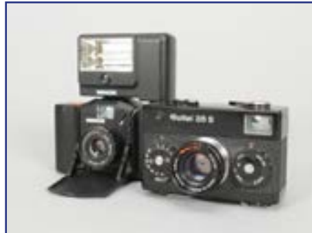
470. A Rollei and Minox 35mm Compact Cameras , Rollei 35-S, black, shutter working, some brassing, dings to top plate, otherwise untested, a Minox 35-GL, in case, with flash and manuals £40-60