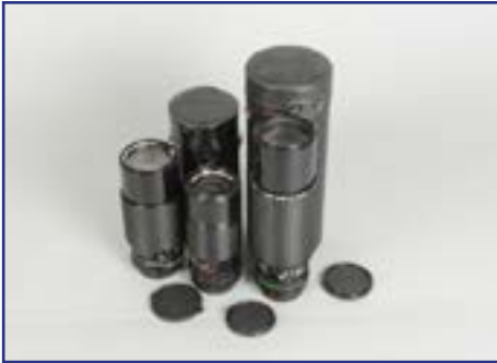
15. Three Canon FDn Medium Zoom Lenses , a 70-150mm f/4.5 lens, a 70-210mm f/4 lens with macro and a 100-300mm f/5.6 lens, with front and rear caps £30-50