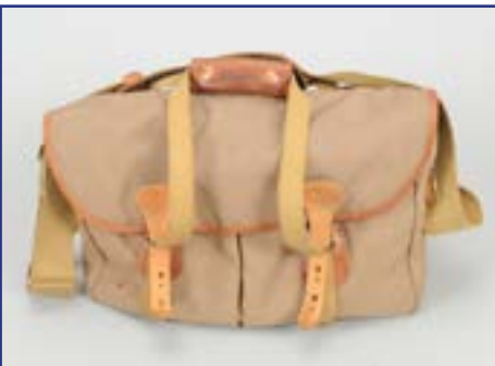
464. A Billingham Camera Bag , Cordura, tan, 41x21x26cm (aprox 815 inner, some creasing, wear, G £50-70