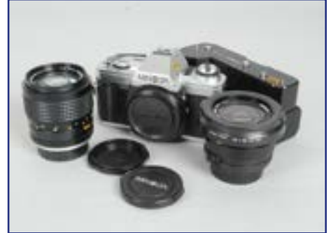
433. A Minolta X-300 SLR Camera , chrome, shutter working, body VG, with 100mm f/2.5 tele rokkor, 24-35mm f/3.5 MD zoom, barrels VG, elements VG, MD-90 motor drive, in Cullmann case £40-60