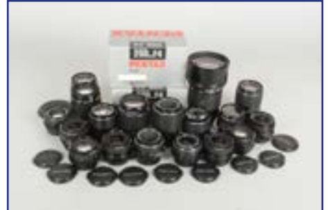
445. Pentax Prime Lenses , 28mm f/2.8 A (5), 35mm f/2.8 M, 50mm f/1.7 A (2), 50mm f/2 M, 50mm f/4 M macro, 100mm f/2.8 M (2), 100mm f/4 M macro, 135 f/2.8 A (2), 135mm f/3.5 M (2), boxed 200mm f/4 M (2) G-VG £150-200