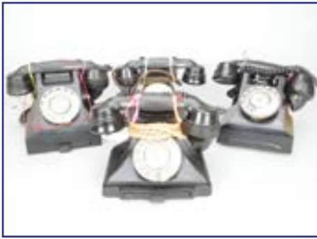
325. Four Black Bakelite Telephone Sets , 1940's/50's, two G.P.O. type 332L with handsets and two G.P.O. type 1/232 with handsets, a lot £60-80