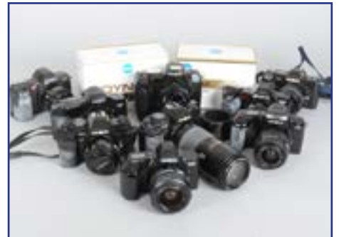
434. A Tray of Minolta SLR Cameras , including, Dynax 700si, 7xi, 7000i, 3000i, Maxxum 8000i, 9000 AF, 5700i, 7000 AF, 9000 AF, all with AF lenses, Dynax 7000i, 9xi bodies in makers box, G-VG £70-90