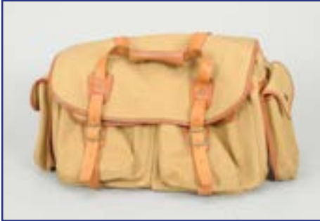
462. A Billingham 550 Camera Bag , canvas, tan, 50x24x31cm (aprox) with end pockets, 815 inner, some creasing, wear to bottom £60-80