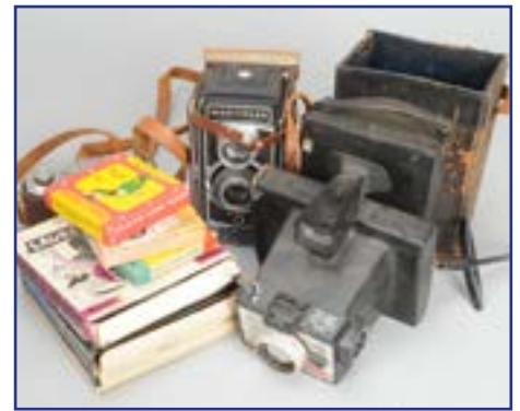
149. Cameras and 8mm Cine Films , including a Nettel 9 x 12cm folding plate camera with plate holders, a Zeca Goldi 3 x 4cm folding roll film camera, a Montiflex TLR camera, a Halina 35X camera, a Six-20 Folding Brownie camera and 7 package 8mm cine films with Laurel & Hardy, Chaplin and others, a Lot £40-60