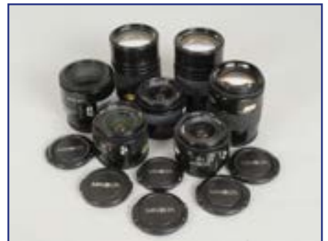
435. Minolta AF Prime Lenses , including, 50mm f/2.8 macro, 24mm f/2.8, 28mm f/2.8 (2), 100mm f/2, 135mm f/2.8 (2), with caps, G £50-70