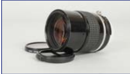
405. A Nikon Nikkor 135mm f/2.8 AI-S Lens , serial no 933619, barrel G, slight scratches, wear to mount ring, elements F-G, scratches to front element, internal dust, with caps £60-80