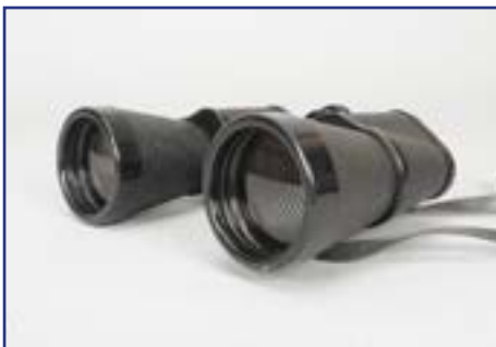
143. Mark Scheffel 20 x 50 Binoculars , field 3 degrees, triple tested, body G, optics, G, T.E Japan, serial no. 86079, with all caps and a case £20-30