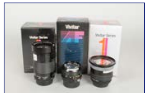
423. Nikon Mount Vivitar Lenses , including, series 1 24-70mm, f/3.8-4.8 macro 1.5x AI-S, 28-70mm f/2.8 AF, 70-210mm f/4.5 AF and three other lenses, overall G £80-120