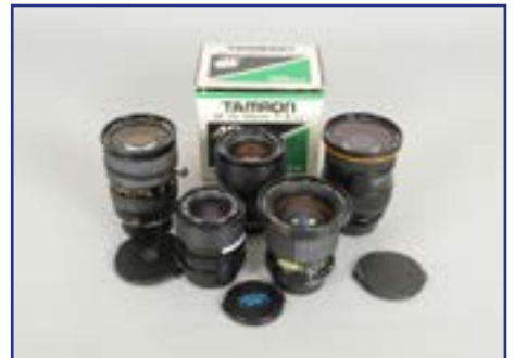
447. Pentax Mount Lenses , including Carl Zeiss Jena 35-70mm f/3.5-4.8 MC macro, 21-35mm f/3.5-4.2 Sigma zoom II, Tokina AT-X AF 28-70mm f/2.8 and other examples, G-VG £40-60