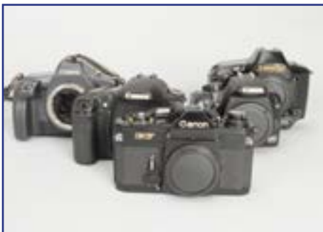
495. Canon SLR and DSLR bodies , EOS30D, EOS1000D, EOS600, T90 and EF (5) £80-120