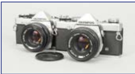
451. Two Olympus OM SLR Cameras , an OM-1, OM-2n MD's, shutters working, with Zuiko auto-s 50mm f/1.8 lenses, overall G-VG £60-80