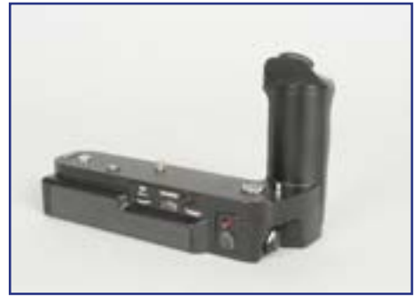
22. A Canon AE Power Winder FN , serial no. 189884, for Canon F-1 New, VG, tested and working, unboxed £60-80