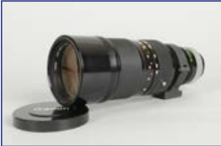
17. A Canon FD 85-300mm f/4.5 S.S.C. Zoom Lens , serial no. 12610, barrel G-VG, elements G-VG, with tripod clamp and maker's front and rear caps £80-120