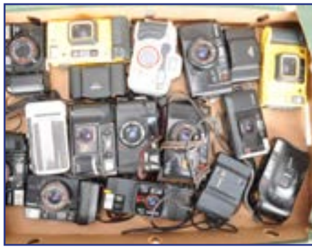
317. A Tray of Canon and Other Compact Cameras, including a Canon AF35M, a Canon MC, Canon Sure Shot A1 and EX, two Minox 35EL, other brands include Konica, Minolta and Nikon, A/F £30-50