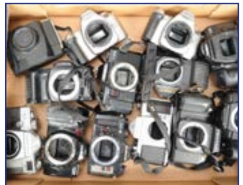
324. A Tray of Various SLR Bodies, brands include Canon, Chinon, Minolta, Nikon, Olympus, Pentax and Praktica, A/F £30-50