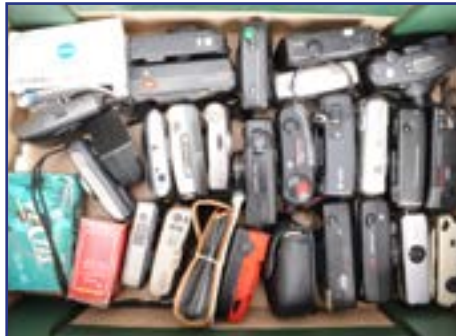
318. A Tray of Assorted Compact Cameras, brands include Canon, Fujifilm, Goldline, Kodak, Minolta, Miranda, Olympus, Panasonic, Pentax and Vivitar, A/F £30-50