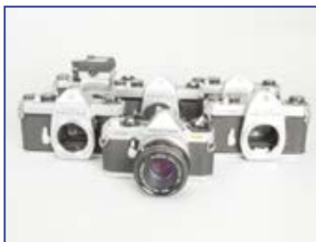
496. Pentax SLR Cameras , MG with f/2 50mm lens, SV body with Pentax Meter head, SP II Spotmatic body, SP Spotmatic body (2), Spotmatic SP F and incomplete 50mm f/1.7 lens (7) £70-100