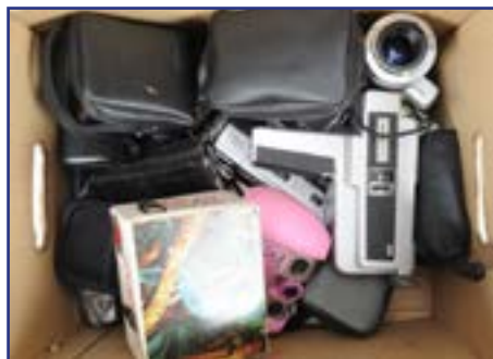
308. Cameras and Flashguns , brands include Fujica, Fujifilm, Halina, Hanimex, Helios, Konica Minolta, Olympus, Panasonic Samsung, Soltron, Sunpak, Vivitar, a lot £20-30