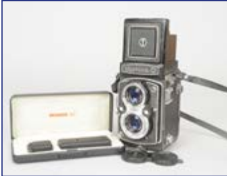
141. A Minox EC Camera and a Yashica D TLR Camera , a Minox EC 9.5mm sub-miniature camera in maker's presentation case and a Yashica D roll film 6 x 6cm TLR camera with lens caps and hood, all in a Tamrac camera bag £40-60