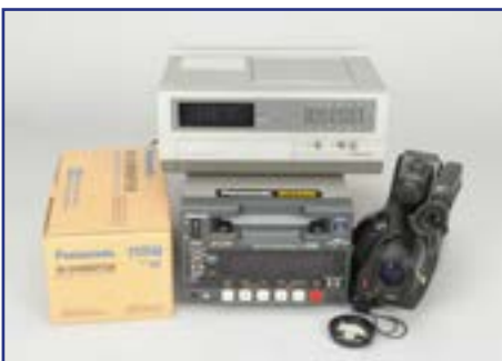
331. Panasonic Video Equipment , a Panasonic NV-MS95 S-VHS-C video camcorder, a Panasonic NV-V300 programmable video tuner in maker's padded soft case, a Panasonic AJ-D230E DVCPRO digital video cassette recorder and 15 sealed unused Panasonic DVC mini DV blank tapes, all untested £40-60