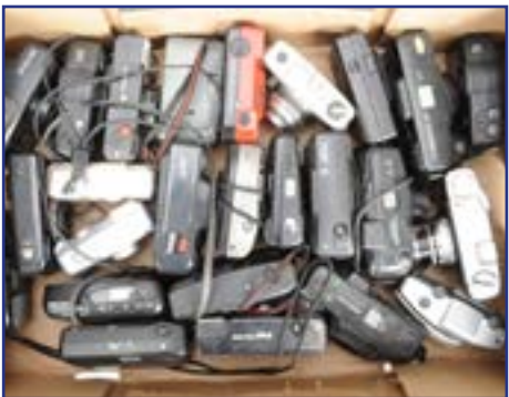
315. A Tray of 35mm Cameras, brands include Beirrette, Canon, Hanimex, Minolta, Nikon, Olympus, Pentax, Vivitar and Yashica, A/F £30-50