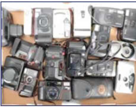
313. A Tray of Compact Cameras, brands include Canon, Fuji (2), Minolta, Nikon (3), Olympus, Pentax (4), Polaroid, Ricoh, A/F £30-50