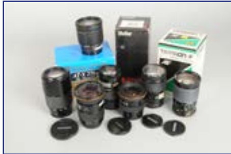
441. A Tray of Minolta Mount Lenses , including, Tokina AT-X 270 AF 28-70mm f/2.8, Tamron 70-210mm f/3.5-4.5 AF, Vivitar 28-200mm f/3.5-5.3 macro, all boxed, Tamron LD 28-200mm f/3.8-5.6 aspherical and others, G-VG £80-100