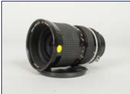
407. A Nikon Zoom Nikkor 25-50mm f/4 AI Lens , serial no 180888, barrel G-VG, light scratches, light wear to mount ring, elements G-VG, some internal dust, with caps £40-60