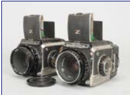
484. Two Zenza Bronica S2 Cameras , one with 75mm f/2.8 Nikkor-P lens, one with 75mm f/2.8 Nikkor-P-C lens, shutters firing, overall F-G £70-90