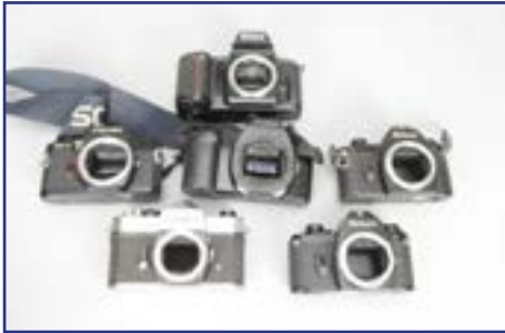
299. Nikon and Other SLR Bodies , comprising a Nikon F-601, two Nikon EM, a Canon EOS 1000, a Petri GX-4 and a Yashica TL-Electro, a lot £30-50