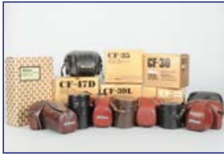
391. Nikon Camera and Lens Cases , including, CF-47D, CF-35, CF-39L, CF-30, CF-22, boxed, overall G-VG, other camera cases and a selection of lens cases £70-90