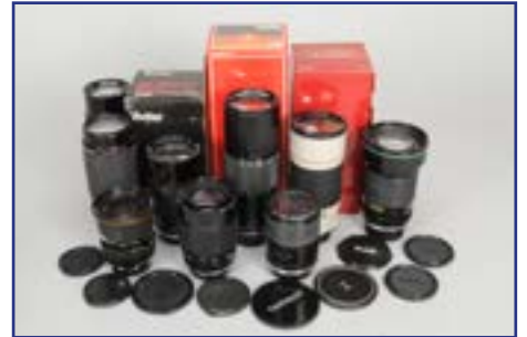
459. A Tray of Olympus Mount Lenses , Sigma 300mm f/5.6, Sigma 50-200mm f/3.5-4.5 zoom, Vivitar 28-135mm f/3.5-4.5, (all in makers box), Tokina, Tamron examples, nine in total, overall G-VG £120-180