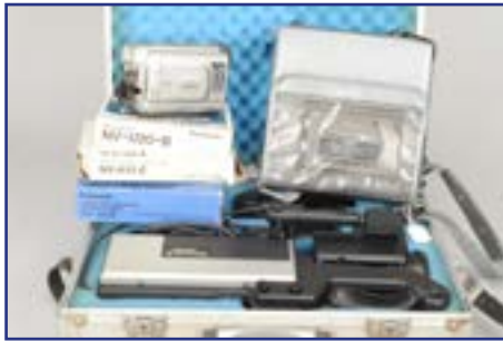
329. Panasonic Video Cameras and Portable Video Recorder , a Panasonic NV-DS5 Mini DV camcorder, a Panasonic WVP-100E video camera in a fitted aluminium camera, a Panasonic NV-200 Compact VHS-C portable video recorder in a Panasonic soft carrying case and some Panasonic video accessories, untested £40-60