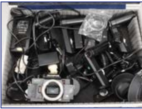
461. Olympus Accessories , including, grips, power winders, flash units, cables, cases, lens hoods, in two aluminum flight cases and tamron bag £80-100