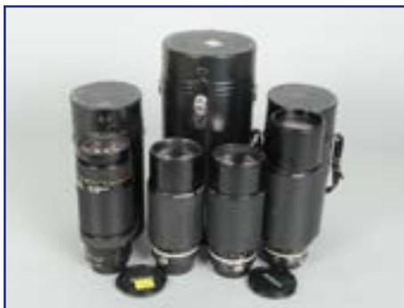
419. Four Nikon Zoom-Nikkor Lenses , one 75-300mm f/4.5-5.6 AF lens, G-VG, two series E, 80-200mm f/4 AI-S lenses, G and one 100-300mm f/5.6 AI-S lens, G-VG £70-90