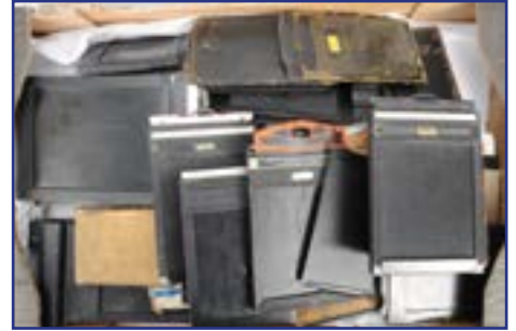
486. Large Format Double Dark Slide Film Backs , a large quantity in various sizes, 8½ x 6½ in. (one), 7 x 5 in. (6 approx.), 5 x 4 in. (6 approx), 9 x 12 cm, 6 x 9 cm and a Polaroid 545 film holder £40-60