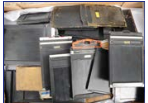
487. Large Format Camera Bodies and Parts , including a Shew Reflector Reflex 6½ x 4¾ in. camera body, a Kodak Limited 6½ x 4¾ in. view camera body, other camera bodies and parts £40-60