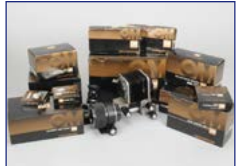
460. Olympus OM-System Accessories , including auto bellows, T28 macro twin flash 1, telescopic auto extension tube 65-116, M 18v control grip 2, AC adaptor 2, sync cables, all in makers box and other items £100-150