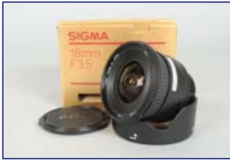
428. A Sigma 18mm f/3.5 Nikon Mount AF Lens , barrel VG-E, elements VG-E, in makers box, with manual £50-70