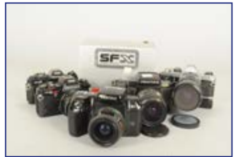
444. Pentax SLR Cameras , a MX, shutter working, with 28-80mm zoom, programe A, shutter working, w0ith Tamron 28mm f/2.8 lens, Super-A body, shutter faulty, body VG, SFXn with 28-80mm lens, +Z-1 and boxed SFX body £60-80