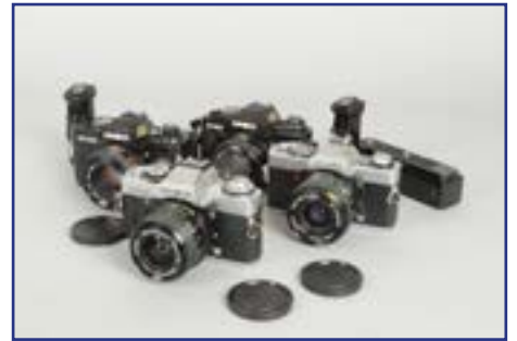
432. Four Minolta SLR Cameras , a X-700 MPS, with 50mm f/1.7 MD lens, X-500, with 50mm f/1.7 MD lens, XGS, with 35mm f/2.8 MD lens, all shutters working, overall G-VG, with two motor drives £100-150