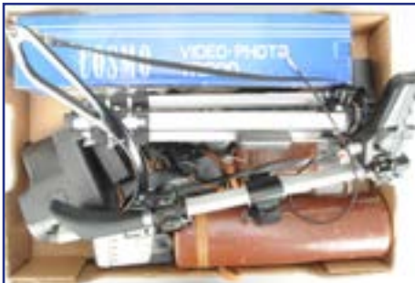
142. Film Cameras and Accessories , items include Fujifilm Digital, Kodak Etralite, Kodak Retina, Polaroid, Pentax, Pentax Espio, a Tamron 400mm f/6.9 M42 lens, 2 tripods and a shoulder stock, A/F £30-50