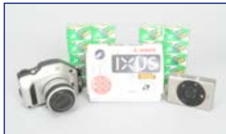
469. Advanced System Cameras , including, a Canon Ixus Elph, in makers box, another, unboxed, Nikon Pronea-s, and a quantity of Fujicolor Advanced system films, unopened, aprox 40 £20-30