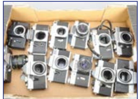
323. A Tray of Praktica and Other SLR Bodies, including a Praktica LB, LLC, an LTL, MTL3 (3 examples) and a Super TL, a Zeiss Ikon Voigtlander Icarex 35S, a Yashica J-5 and a Zenit EM together with a Kowa H camera and a Prinzflex 500 camera, A/F £30-50