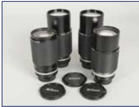
416. Four Nikon Nikkor-Zoom Lenses , a 35-200mm f/3.5-4.5 AI-S lens, 50-135mm f/3.5 AI lens, two 70-210mm f/4 series E AI lenses, with caps, overall G-VG £70-90