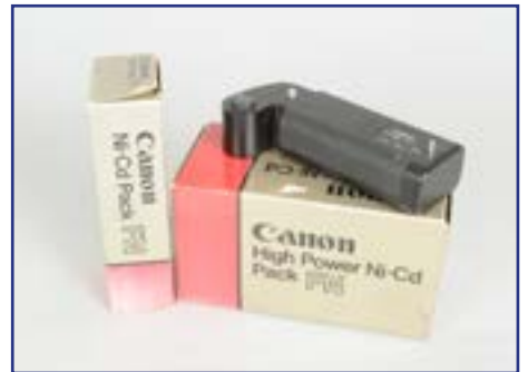
24. A Canon High Power Ni-Cd Pack FN , for Motor Drive FN, together with a Canon Ni-Cd Pack FN, both untested, both in maker's boxes and a Battery Pack FN £30-50