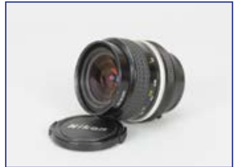
474. A Nikon Nikkor 24mm f/2 AI Wide Angle Lens , elements G-VG, some internal dust, barrel G-VG, with caps £100-150