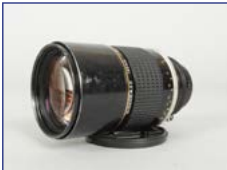
406. A Nikon Nikkor ED* 180mm f/2.8 AI-S Lens , serial no 435653, barrel F-G, scratches, brassing to mount ring, elements F-G, scratches to front element, internal dust, with caps £70-90