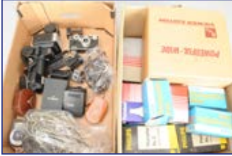
477. Camera Related Items , including, an Argus Brick camera, Metz 45CT-4, 32CT3 flash units, Gossen Luna Pro-F meter, other light meters, 8mm viewer editor, selection of photographic lamps, flight case and other items £40-60