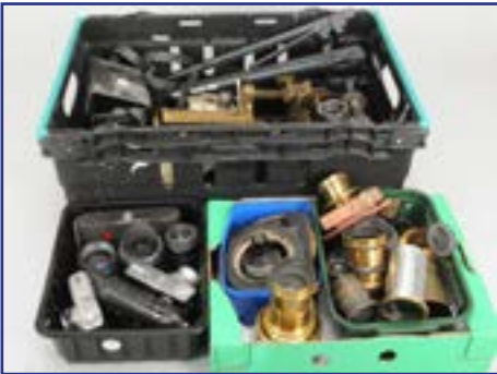
491. A Quantity of Brass Lenses , together with some twentieth century lenses, a Zeiss Ikon Contessa camera, a Kodak Regent and an Ensign Ranger folding cameras and some Linhof tripod parts, A/F £60-80