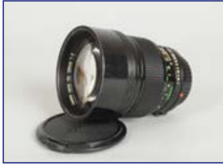
19. A Canon FDn 135mm f/2 Lens , serial no. 21258, body F, owner's label with a ref. no., elements VG, with front and rear caps £80-120