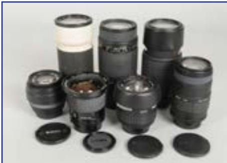
427. Nikon Mount Sigma Lenses , including, 180mm f/5.6 AF APO, 18-50mm f/3.5-5.6 DC, 28-105mm f/4-5.6 UC zoom, 75-300mm f/4-4.6 APO, 75-300mm f/4.5-5.6 AF APO, 21-35mm f/3.5-4.2 AI-S, 50-200mm f/3.5-4.5 AI-S, overall G-VG £80-120