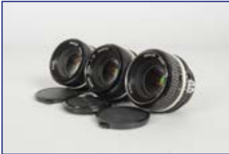
401. Three Nikon Nikkor 50mm f/1.8 AI Lenses , overall G, with caps £100-150