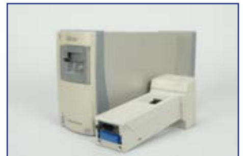
475. A Nikon Coolscan V ED Slide and Film Scanner , with SR-21 strip film adapter, cables and manual, untested £100-150