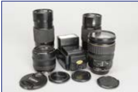
494. Canon SLR Lenses , 28-135mm Image Stabilizer Ultrasonic macro zoom, FD f/4 200mm, 35-70mm f/3.5-4.5 EF Zoom and FD f/4 200mm SSC, with Speedlite 199A (5) £70-100