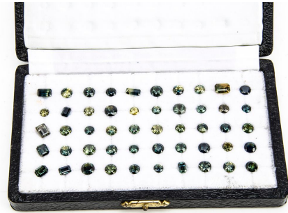
Feature Lot 359

Fifty loose natural non heat treated fancy coloured and bi coloured sapphires, various cuts of baguette and round, in fitted case