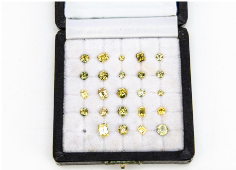
Feature Lot 358

Twenty four loose natural non heat treated yellow and golden sapphires, of octagonal, rectangular and round cut, various carats, in fitted case