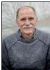
Dave Howe Sports & Music Ephemera