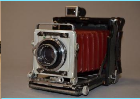
Press & Studio Cameras