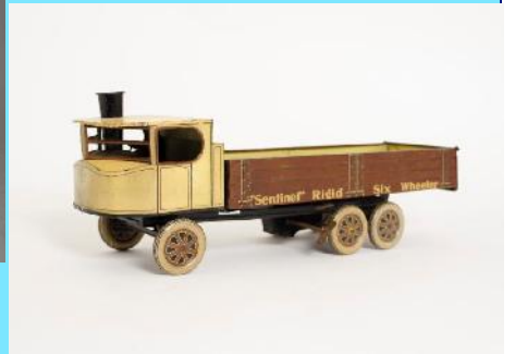
Tinplate & Other Rare Toys

Auction Date: Tuesday 29th January Start Time: 10:00 Viewing: Monday 28th January