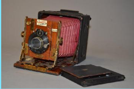
Antique Mahogany & Brass

Auction Date: Tuesday 22nd February Start Time: 10:00 Viewing: Monday 21st February