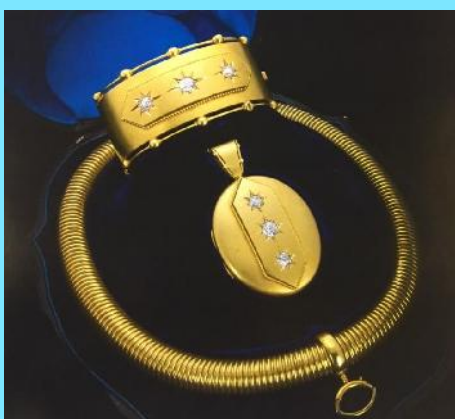
Over 350 lots of Jewellery