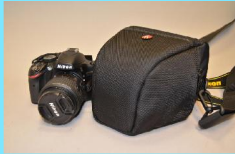
Modern Digital SLRs

Auction Date: Tuesday 22nd February Start Time: 10:00 Viewing: Monday 21st February