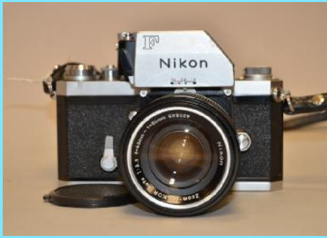
Individual and group lots