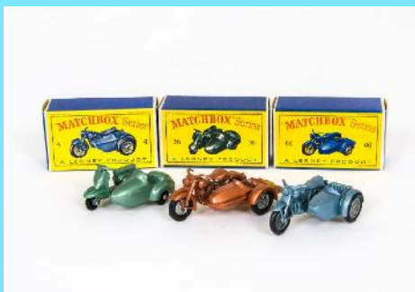
A Private Collection of Matchbox