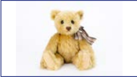
256. A Steiff limited edition 1990 British Collector's Teddy Bear 1906, 370 of 3000, in original box with certificate £40-60