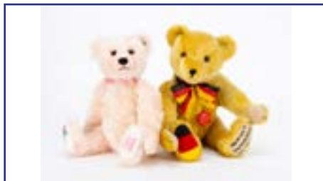
262. A Steiff limited edition Queen Mother Bear, 1236 of 2002, in original box with certificate, 2002; and a Hermann Vereinigung bear £50-80