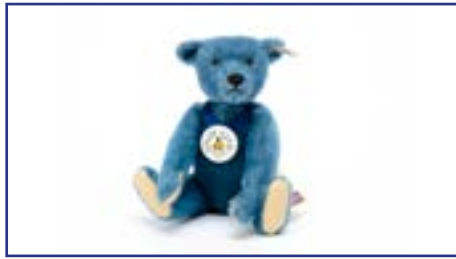
187. A Steiff limited Club Edition blue Teddy Bear 1908, 3795 for the year 1994/95, in original box with certificate £40-60