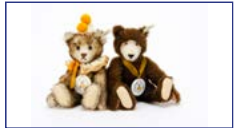
193. Two Steiff Club Edition teddy bears: 1993/94 Teddy Clown 1928, 8395 for the year; and 1996/97 Dicky Brown Bear 1935, 3551 for the year, both with certificates £50-80