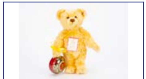
13. A Steiff limited edition Holland Bear 1998 , Gouda cheese colour, 1300 of 1847, in original box with certificate £60-80