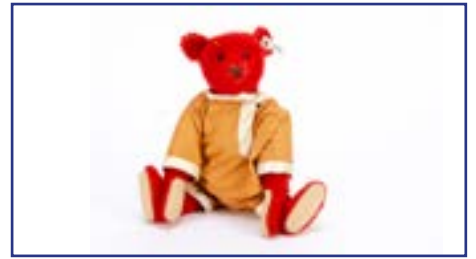
227. A Steiff limited edition for Teddy Bears of Witney Alfonzo, 563 of 5000, in original box with certificate, 1990/91 (slight wear to box) £50-80