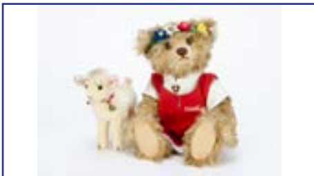
79. A Steiff limited edition Heidi with goat , 189 of 1500 in original bag with certificate, 2002 £60-80