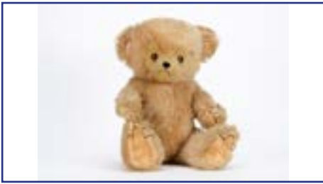
43. An unusual post-war Chiltern teddy bear cub , with pale pink synthetic mix plush, heart shaped face mask, dark orange and black plastic eyes, pink synthetic plush ear lining and pads, large swivel head, jointed limbs with black stitched webbed claws, growler and printed label in back of head seam -21in. (53.5cm.) high (a little dusty and faded) £80-120