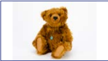
63. A Steiff limited edition Irish Teddy Bear , 66 of 2000, in original box with certificate, 2002 £40-60