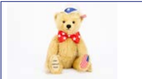
66. A Steiff limited edition The First American Teddy , 7183 for the year 2003, in original box with certificate £70-100