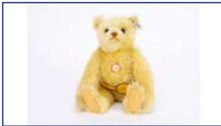
226. A Steiff limited edition Musical Bear 1928 Yellow, 3063 of 8000, in original box with certificate, 1992 (box a little crumpled) £60-80