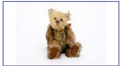
181. A Charlie Bears limited edition Ernie , with tags, certificate and a Charlie Bears linen bag -11in. (28cm.) high £30-50