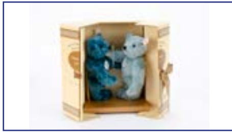
235. A Steiff limited edition Special North American Edition Forever Friends Blue 23, 1539 of 4000, in original box with certificate, 1996 £60-80