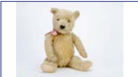
45. A 1930s Chiltern-type teddy bear , with light golden mohair, clear and black glass eyes, pronounced muzzle, black stitched nose, mouth and claws, swivel head, jointed limbs with cloth pads, rounded hump and inoperative growler -21in. (53cm.) high (slight general wear) £70-100