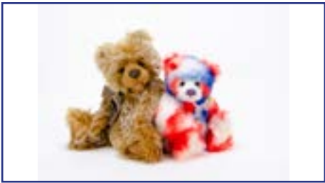
185. Two Charlie Bears: Paddywack -16 1/2in. (42cm.) high; and Brit with tags and a Charlie Bears linen bag £50-80