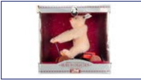
219. A Steiff Museum Collection limited edition Record Teddy Rose, 1737 of 4000, in original box, 1991 (some damage to box) £40-60