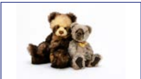
186. Two Charlie Bears: Rory -19in. (48cm.) high; and Amy with tags and a Charlie Bears linen bag £50-80