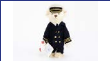
2. A Steiff limited edition SS Passat Bear , exclusive for Kaufmann Erich Morgenroth, 247 of 1500 with tag certificate, 1996 £50-80