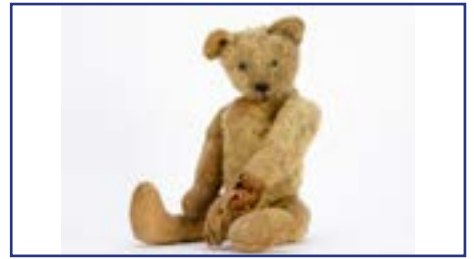
49. An early British teddy bear 1910-20s , with blonde mohair, small black boot button eyes, pronounced muzzle, replaced stitched nose and mouth, swivel head, jointed limbs, hump and inoperative growler -21in. (53.5cm.) high (broken wrist, balding, general wear, replaced pads and dusty); with a recent smock £50-80