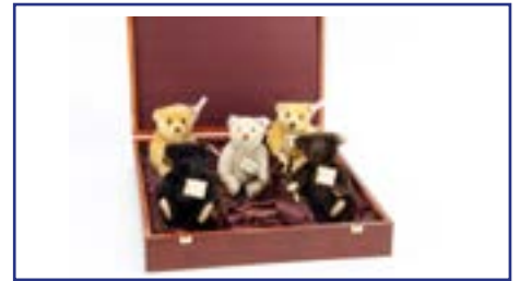
241. A Steiff limited edition Baby Bear Set 1989-1993, 901 of 1847, five bears, in original wooden box with certificate £70-100