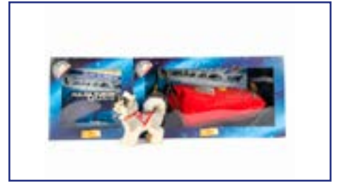
240. A Steiff limited edition Fulda Yukon Quest Husky Sledge Set, 1482 of 3000, in original boxes, 1998 £40-60