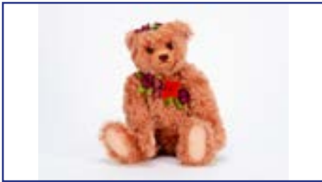
76. A Steiff limited edition Marianne Meisel teddy bear , 1712 for 2007, in original bag with certificate £50-80