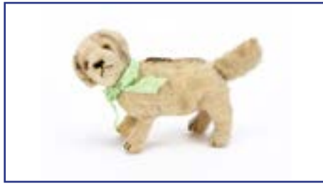
152. A small German dog purse 1930s , with brown tipped mohair, now faded to beige, pale orange and black glass eyes, black stitched nose, mouth and claws, swivel head, standing on all fours, inoperative squeaker in tail and zipper down back with blue lining -9 1/2in. (24cm.) long including tail some general wear and thinning £200-300