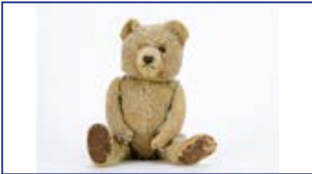
44. A post-war Chiltern Ting-a-Ling type teddy bear , with beige mohair, one orange and black glass eyes, short cream mohair muzzle, tops of feet and ear lining, swivel head, jointed limbs with oil-cloth pads and inoperative chime mechanism -14 1/2in. (37cm.) high (general wear and thinning, damage to feet pads) £30-50