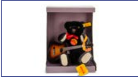
221. A Steiff unusual yellow tagged Bobby Musical Teddy Bear black, with guitar, in original box, 1993 (slight damage to box) £50-80