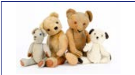
175. Four British teddy bears: a Chad Valley 1930s teddy bear with celluloid button in ear -18in. (46cm.) high (damaged left arm, worn and replaced eyes); a synthetic mixed mohair post-war Chad Valley; and two others £60-80