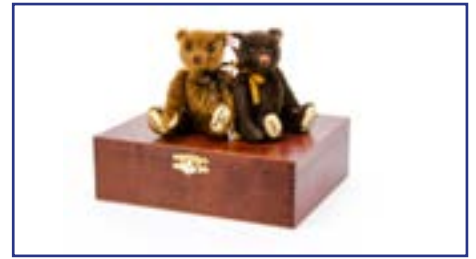
239. A Steiff limited edition Ambao Chocolate Belgium Bear Set, 390 of 1500, two bears in original wooden box, 2001 £60-80