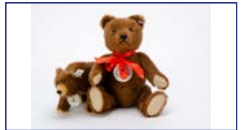
194. Two Steiff Club Edition teddy bears: 2001/2002 Growling Bear 1934, 2512 for the year, in original box with certificate; and 2001 dark brown Teddy Bear 1950, 4040 for the year with certificate £50-80