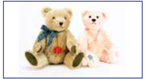
263. A Steiff limited edition Queen Mother Bear, 377 of 2002, in original box with certificate 2002; and a Hermann teddy bear £50-80