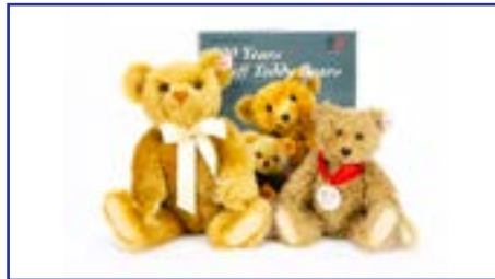
82. Two Steiff limited edition teddy bears: Teddy Bear with Book entitled '100 Years of Steiff Teddy Bears' , 1458 of 1902, in original box, 2002; and for Harrods Percy musical bear, 338 of 1500 with certificate, 2003 (no box) £50-80