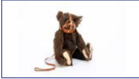
224. A Steiff limited edition Muzzle Bear 1908, 282 of 5000, in original box with certificate, 1991/92 £60-80