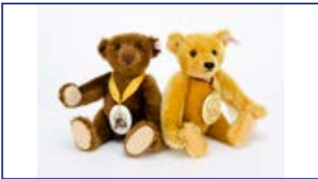
65. Two Steiff collector's teddy bears: a Margarete Steiff Museum 1998 teddy bear; and a brown 150th birthday of Margarete Steiff bear with medallions and tags £50-80