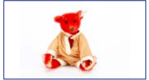
228. A Steiff limited edition for Teddy Bears of Witney Baby Alfonzo, 1926 of 5000, in original box with certificate, 1995 £50-80