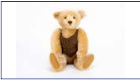
231. A Steiff limited edition 1996 British Collector's Teddy Bear Blonde, 1529 of 3000, in original box with certificate £50-80