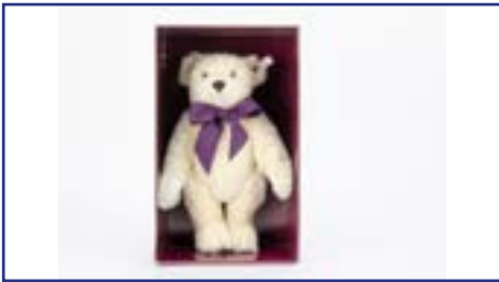
233. A Steiff limited edition for Hamleys Charlotte teddy bear, 1755 of 2000, in original box with certificate, 1994/95 £50-80