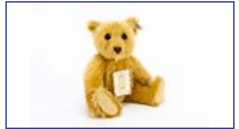
230. A Steiff limited edition 1990 British Collector's Teddy Bear 1906, 2351 of 3000, in original box with certificate £50-80