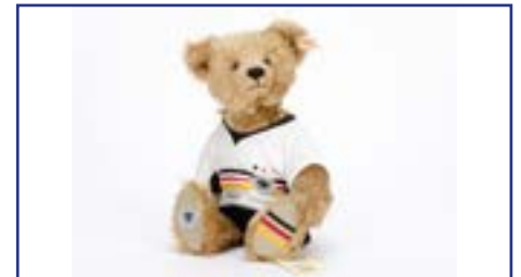
74. A Steiff limited edition Deutscher Fussball-Bund teddy bear , 781 of 1998 with tag certificate, 1998 £30-50