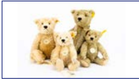
236. Four Steiff yellow tagged Classic Teddy Bears: all 1920s style with tags -15 1/2in. (39.5cm.) high £50-80