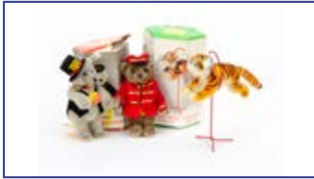
225. Steiff Golden Age of Circus limited editions: Bear Band Master, 1988-89 and Jumping Tiger, 1991, in original boxes (boxes squashed); and a Teddy Baby Ticket Seller £80-100