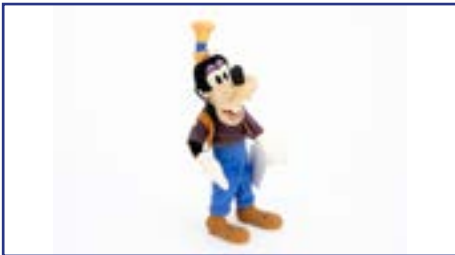
3. A Steiff limited edition Disney Showcase Collection Goofy , 931 of 2000, in original box with tag certificate, 2002 £60-80