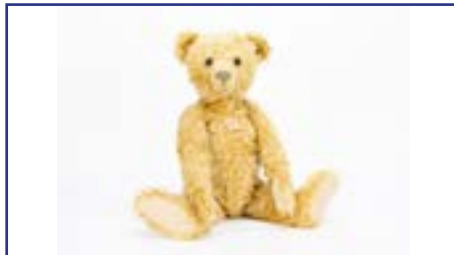
69. A Steiff limited edition Baerle 43 PAB 1904 , 882 for 2004, in original box with certificate £80-100