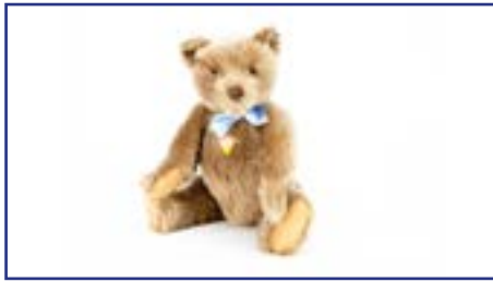
223. A Steiff limited edition Replica 1996 Teddy Bear 1951 Caramel, 1519 of 5000, in original box with certificate £50-80