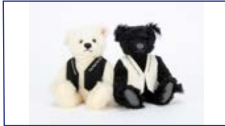
81. Two Steiff Club Event Teddy Bears , for The Real McCoy, white 2002, 872 for the year and black 2003, 1539 for the year, in original boxes with certificates £70-100