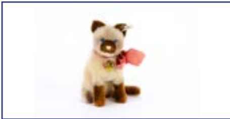
222. A Steiff limited edition Replica 1994 Siamy Cat 1930, 381 of 4000, in original box with certificate £40-60