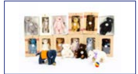
85. Sixteen Steiff Club Gift Teddy Bears: 1997 to 2011 and 2013 , in original boxes (2008 box crushed and missing lid) £160-180