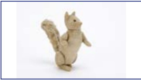
149. A early German six-way jointed grey squirrel 1920s , with grey and white mohair, black boot button eyes, pink stitched nose, mouth and claws, swivel head, jointed limbs, jointed longer mohair tail and inoperative squeaker -10in. (25.5cm.) high (some general wear and thinning) £150-200