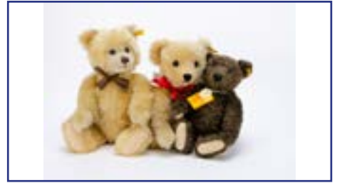
192. Three yellow tagged Steiff teddy bears: a 1909 Original Teddy Bear Replica -17in. (43cm.) high; a brown 1920s Classic and another, all with tags (chest tags suspended on string around neck) £50-80