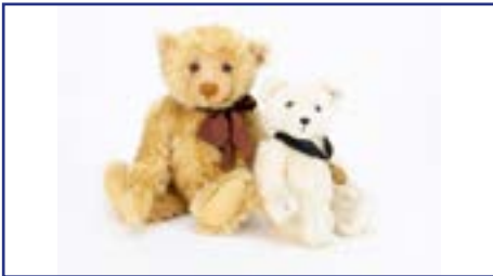
257. Two Steiff limited edition teddy bears: Year 2000 Teddy Bear, 3363 for the year 1999, in original box with certificate; and Dawn of a New Century 12th Annual Teddy Bear & Doll Convention at Walt Disney World with tag certificate £50-80