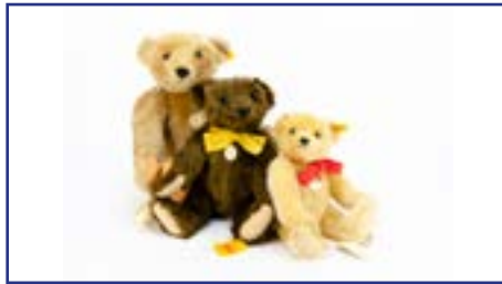
237. Three Steiff yellow tagged Classic Teddy Bears: two 1909 and one 1906 with tags -20 1/2in. (52cm.) high £50-80