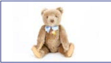
255. A Steiff limited edition Replica Teddy Bear 1951 Caramel, 1520 of 5000, in original box with certificate, 1996 (dusty) £50-80