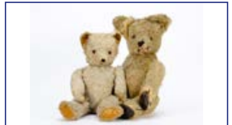
51. A 1940s teddy bear , probably French with golden mohair, clear and black glass eyes with remains of brown backs, black stitched nose and red mouth, swivel head, jointed limbs with leatherette pads and growler -21 1/2in. (54.5cm.) high (bald areas, one hand damaged around pad, general wear and dusty); and another with white synthetic plush (wear) £40-60