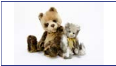
183. Two Charlie Bears: Woody -20in. (51cm.) high; and Layla with tags and a Charlie Bears linen bag £50-80