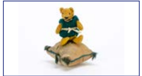
157. A 1920s teddy bear pincushion , a yellow velvet teddy bear with black bead eyes, black stitched nose and mouth, pin-jointed limbs, seated on a silk cushion and added knitted jumper -4 3/4in. (12cm.) high (cushion fraying and faded) £100-150