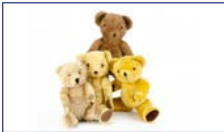
178. A post-war Chiltern Hugmee teddy bear , with blonde mohair, orange and black plastic eyes, black stitched nose and mouth, swivel head, jointed limbs with felt pads and squeaker -14 1/2in. (37cm.) high (some wear and thinning); and three other post-war bears £50-70