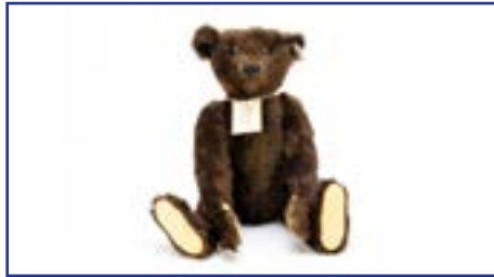
188. A Steiff limited edition 1993 British Collector's Teddy Bear 1907, brown, 154 of 3000, in original box (missing certificate) £50-80