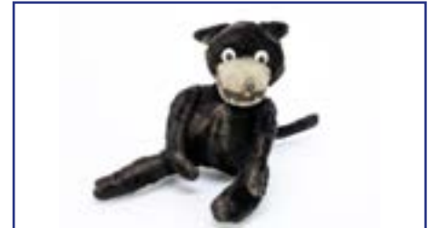
87. A large British mohair Felix the Cat 1920s , with black mohair, large white and black glass eyes, pronounced white mohair muzzle, black wooden bead nose, black felt open mouth with white stitched teeth, swivel head, wired limbs and tail and inoperative squeaker -18 1/2in. (47cm.) high (some general wear, one arm missing stuffing and some wire protruding) £80-120