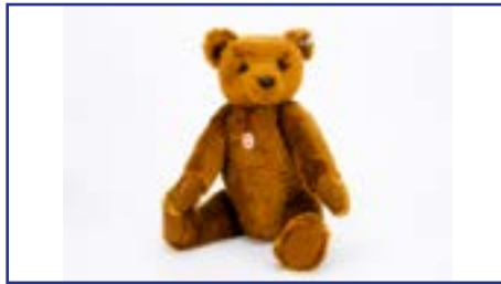
67. A Steiff limited edition Bear 55 PB 1902 , 2178 of 7000, in original box with certificate £80-100