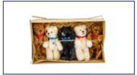
155. A box of five German Anna Englebrecht teddy bears , two white, two brown and one black, synthetic, artsilk and mohair plushes, pin-jointed, fixed necks and glass eyes, one with Made in Germany label, in a plain card box with excelsior packing, 1950-60s -5 1/4in. (13.5cm.) high, £80-120