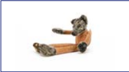
150. A Chad Valley Tango dog 1930s , with frosted black mohair head, hands and feet, clear and black glass eyes with remains of brown painted backs, long muzzle, black stitched nose, mouth and claws, swivel head, pink velvet body with dangling limbs, red and white woven label on foot and 'Maisie Mackenzie' woven name tag in shoulder seam -7 3/4in. (19.5cm.) high (small hole in one foot, slight general wear and velvet discoloured) £70-100