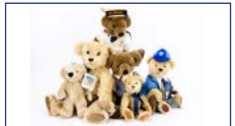
265. Two large Judy Sparrow teddy bears; and four Romsey Bear Company bears £30-50