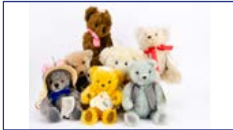
260. Seven Dean's Rag Book limited edition Carnival teddy bears: editions of 250 from the Pontypool Gwent factory comprising James, Fleur, Jenny, Masie, Raymond, Samuel and Wilhelmina all with tags, 1990s £70-100