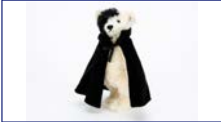
77. A Steiff limited edition Musical Bear "Phantom of the Opera" , 2253 of 3000, in original bag with certificate, 2005 £50-80