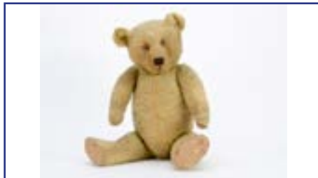
48. A 1930s British teddy bear , with blonde mohair, orange and black glass eyes, pronounced clipped muzzle, black stitched nose, mouth and claws, swivel head, jointed limbs, hump and inoperative squeaker -26in. (66cm.) high (wear and thinning, one eye broken, pads recovered and dusty) £40-60