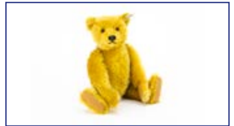
229. A Steiff limited edition 1994 British Collector's Teddy Bear 1908, 695 of 3000, in original box with certificate £50-80