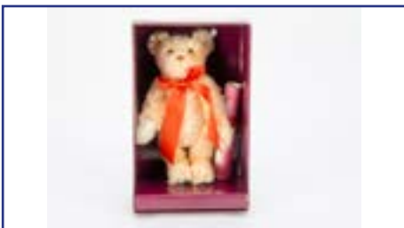
234. A Steiff limited edition for Hamleys Chester teddy bear, 748 of 2000, in original box with certificate, 1996 (box lid damaged) £50-80