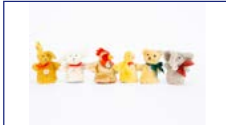
83. Three Steiff limited edition Egg Cosy sets: Rabbit and Lamb , 2013 for the year, 2002; Hen and Chick, 1885 for the year, 2003 and Bear and Elephant, 2462 for the year 2004, in original boxes with certificates £80-120