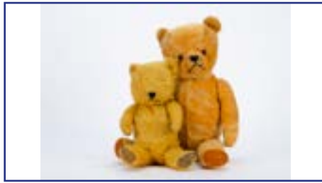
46. A small post-war Chiltern Hugmee teddy bear , with golden mohair, black stitched nose, mouth and claws, swivel head, jointed limbs with oil-cloth pads and inoperative growler -12in. (30.5cm.) high (missing eyes and some general wear); and another post-war British bear (worn) £50-80