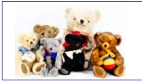
259. Six Dean's Rag Book limited edition Carnival teddy bears: editions of 250 from the Pontypool Gwent factory comprising a large Dominic, Curly, Christopher, Wilfred, Ralph and Jacqueline all with tags, 1990s £70-100