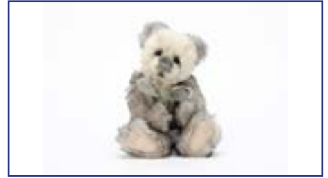
180. A Charlie Bears limited edition Eilish , with tags, certificates and a Charlie Bears linen bag -13in. (33cm.) high £30-50