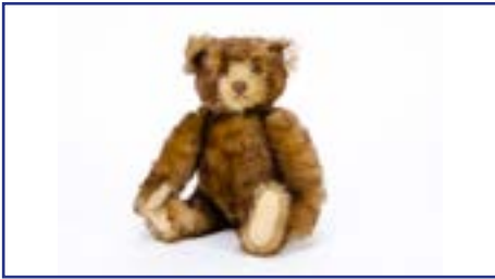
232. A Steiff limited edition 1995 British Collector's Teddy Bear Brown Tipped, 1278 of 3000, in original box with certificate £50-80