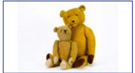
50. Two German teddy bear 1920-30s , the larger with short bright golden mohair, pronounced muzzle, black stitched nose, mouth and claws, slotted-in ears, swivel head, jointed arms and growler -24in. (61cm.) high (missing eyes, pads recovered and some general wear); and a similar smaller example (recovered pads and wear) £50-80