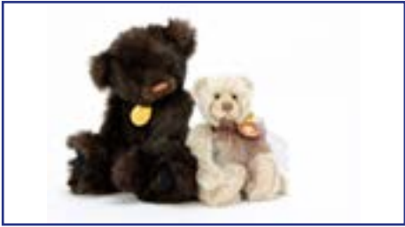
184. Two Charlie Bears: Cody -17in. (43cm.) high; and Zoe with tags and a Charlie Bears linen bag £40-60