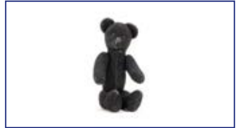
156. An unusual small black teddy bear , possibly Russian with short velvet like plush, black glass eyes, stitched on nose, black stitched mouth, stitched fixed neck, jointed limbs and solidly stuffed -7in. (18cm.) high (very minimal wear) £100-150