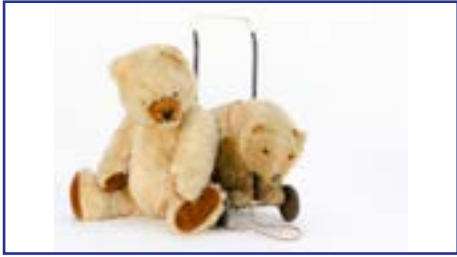
174. A post-war Hamiro teddy bear , with blonde mohair, black plastic eyes, brown mohair muzzle and pads, swivel head and jointed limbs -26in. (66cm.) high (slight wear and thinning); and a 1930s British bear on all fours with metal handle (bald back and wear) £50-80