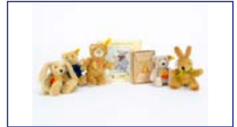
86. Small yellow tagged Steiff teddy bears: a jointed Happy rabbit -5in. (12.5cm.) high; a Merci bear for hanging , two keyring and another; a Teddy Pendant and Chain and a Mini porcelain Millennium plate; both in original boxes £40-60