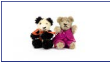
173. Two miniature Schuco teddy bears 1950s , one with beige mohair, black pin eyes, black stitched nose and mouth, metal framed jointed body and a homemade purple felt suit -2 1/2in. (6cm.) high; and a similar black and white panda £50-80