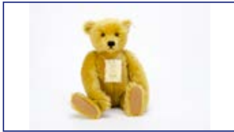
189. A Steiff limited edition 1994 British Collector's Teddy Bear 1908, 49 of 3000, in original box with certificate £50-80