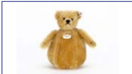
70. A Steiff limited edition Rolly Polly bear 1909 , 1765 of 3000, in original box with certificate £50-80