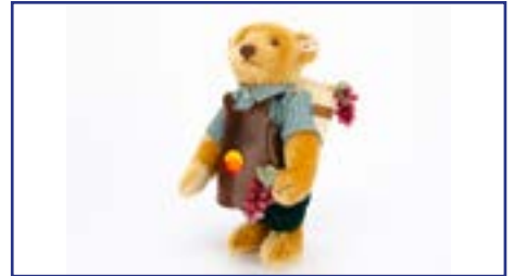
11. A Steiff limited edition Winegrower teddy bear , 294 of 2000, in original box with certificate, 1997 £60-80