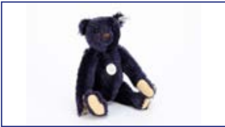
1. A Steiff limited edition dark blue Teddy Bear 1909 , 3720 of 7000, in original box with certificate, 1998 £50-80