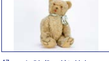
47. An Ede (French) teddy bear 1950s , with curly golden mohair, clear and black glass eyes with orange backs, black wax nose, black stitched mouth and claws stitched as a W onto the pads, red felt tongue, pronounced shorter mohair muzzle and pads, swivel head, jointed limbs and inoperative growler -25in. (63.5cm.) high (some general wear and thinning, dusty) £80-100