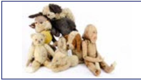
176. A 1930s British teddy bear , with blonde mohair, swivel head and jointed limbs -13in. (34cm.) high (large hole in leg, balding around, replaced eyes, recovered pads and general wear); and six other animals and a bear (wear, bear missing head) £40-60