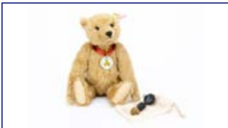
78. A Steiff Club Edition 2004 Franz teddy bear , 3913 for the year with Steiff seal, in original bag with certificate £50-80