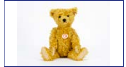
72. A Steiff limited edition 'Side-to-Side' teddy bear , 1447 of 5000, in original box with certificate, 2005 £60-80