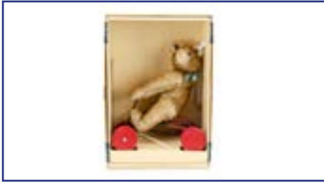
220. A Steiff limited edition Replica 1996 Record Petsy 1928, 605 of 4000, in original box with certificate £60-80