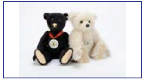
191. Two Steiff Club Edition teddy bears: 1999 black Teddy Bear 1912, 4417 for the year; and 2002 white Bear 28 PB, 1375 for the year, both with certificates £50-80