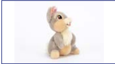
6. A Steiff limited edition Disney Showcase Collection Thumper , 1083 of 5000, in original box with tag certificate, 2002 £40-60