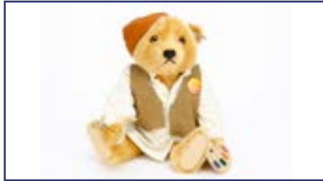
7. A Steiff limited edition The Flemish Painter Brueghel Bear , 1205 for the year 1997, in original box with certificate £60-80