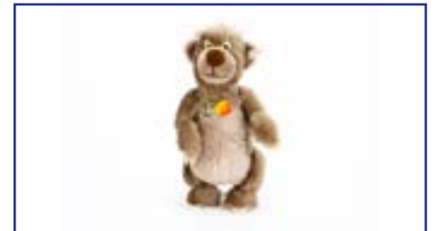
73. A Steiff limited edition Disney Convention 1995 Baloo bear , 536 of 2500 with tag certificate and convention badge £40-60