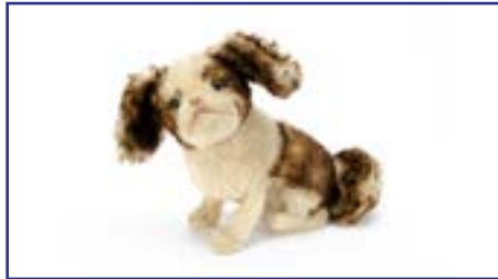
153. A fine and good quality 1930s spaniel , with brown tipped and white mohair, clear and black glass eyes with remains of brown painted backs, large wired ears, brown stitched nose, mouth and front claws, swivel head, seated with curled tail and inoperative squeaker -10 1/2in. 26.5cm. High slight general wear £200-300