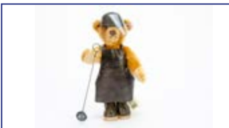
4. A Steiff limited edition Stahlkocher Willi , exclusive for Lutgenau Dortmund, 905 of 1500 with tag certificate, 1996 £50-80