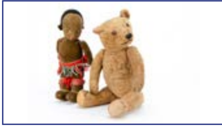
177. An unusual brownish pink towel teddy bear , with orange and black glass eyes, pronounced muzzle, black stitched nose, mouth and claws, swivel head and jointed limbs with cloth pads -22in. (56cm.) high (one leg loose, dust and slight general wear); and a Norah Wellings brown velvet doll with felt tasselled skirt and knee cuffs, wool hair and label on foot (some wear) £70-100