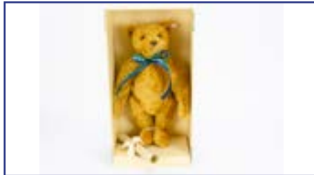
8. A Steiff limited Theo brass Teddy Bear , exclusive for Kaufhof and Horten-Konzern, 891 of 1946, in original box with certificate, 1996 £50-80