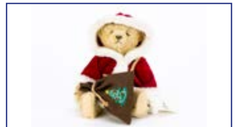
242. A Steiff limited edition Teddy Bear Santa Claus, 2455 of 3000 with tag certificate, 1998 £50-80