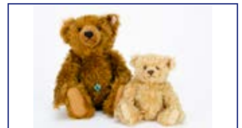
75. Two Steiff limited edition teddy bears: Irish Teddy Bear , 498 of 2000, 2002; and Alexandra excluder QVC, 1185 of 1500, in original boxes with certificates £70-100