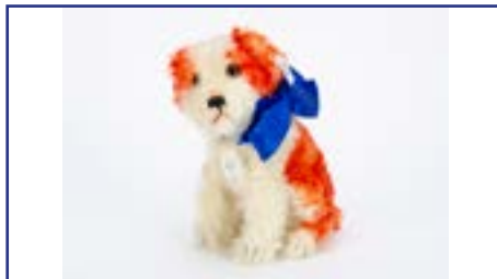
9. A Steiff limited edition Molly Dog 1927 , 453 of 3000, in original box with certificate, 2000 £30-50