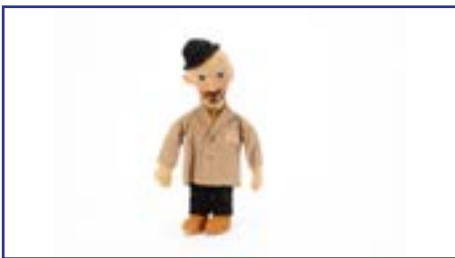
151. A Chad Valley Tom Webster's George doll 1920s , with pressed cloth face, large black and white googly glass eyes, mohair moustache, felt body with original felt clothes, red and white woven label on jacket and sole of shoe -11 1/2in. (29cm.) high (small moth hole to one hand) £70-100