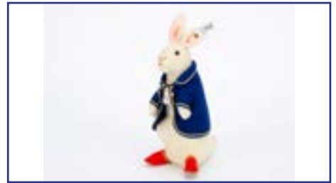
10. A Steiff limited edition Peter Rabbit Replica 1904/5 , 1078 of 3000, in original box with certificate, 2002 £40-60