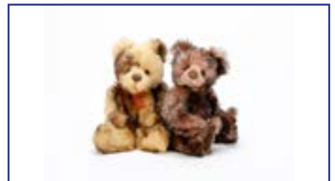
182. Two Charlie Bears: Tiff Toff -16 1/2in. (42cm.) high; and Ashley with tags and a Charlie Bears linen bag £40-60