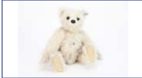
68. A Steiff limited edition Bear 28 PB , white, 4494 for 2002, in original box with certificate £50-80