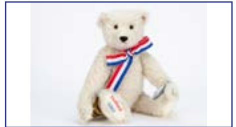
12. A Steiff limited edition Maatjes bear , exclusively designed for the Netherlands, 728 of 1500, in original bag with certificate, 2003 £40-60