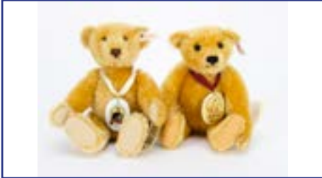
64. Two Steiff collector's teddy bears: a Margarete Steiff Museum 1998 teddy bear; and a blonde 150th birthday of Margarete Steiff bear with medallions and tags £50-80