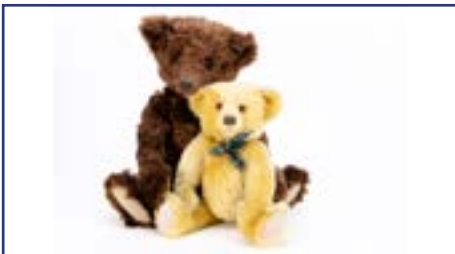
258. An Atlantic Bears limited edition teddy bear, with brown mohair -24in. (61cm.) high; and a modern Dean's Rag Book mouse-eared bear (dusty); and four 1970/80s soft toys £40-60