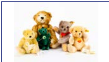
238. Five Steiff yellow tagged Classic Teddy Bears: Green Pepper bear -7 1/2in. (19cm.) high; two Classic Petsy and two others (all with tags other than large Petsy) £70-100