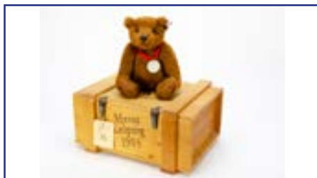
190. A Steiff limited Club Edition Teddy Bear (Bear 420351), 4070 for 2003, in original crate with certificate £50-80