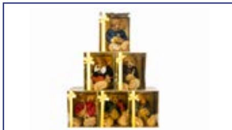
261. Six Dean's Rag Book limited edition Musical teddy bears: Victor the Violin, Max the Sax, Claude the Clarinet, Tommy the Trumpet, Bartholomew the Cello and Horatio the Horn blower, in gold boxes with certificates £120-180