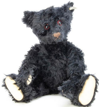
Dolls & Teddy Bears - Day One

Lot 205 A rare Steiff prototype or trial sample of the 1991 British Collector's 1912 Replica black teddy bear, with swivel head, jointed limbs, brown stitched nose, mouth and claws, brass coloured script button and white cloth label, the back of label with handwritten number 0173/48 --19¼in. (49cm.) high went under the hammer at our Newbury Saleroom for £280 plus BP