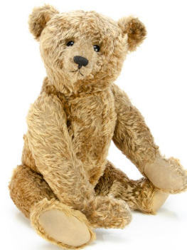
Dolls & Teddy Bears - Day Two

Lot 205 A rare Steiff prototype or trial sample of the 1991 British Collector's 1912 Replica black teddy bear, with swivel head, jointed limbs, brown stitched nose, mouth and claws, brass coloured script button and white cloth label, the back of label with handwritten number 0173/48 --19¼in. (49cm.) high went under the hammer at our Newbury Saleroom for £280 plus BP