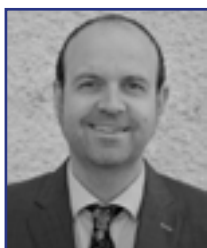
Dominic Foster Toys